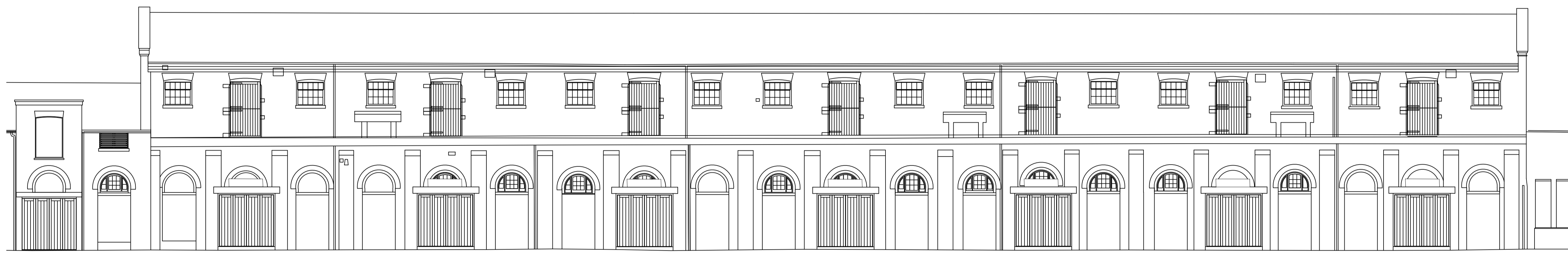
EL MARKET FACING EXISTING ELEVATION (SOUTH) 1:100@A1, 1:200@A3