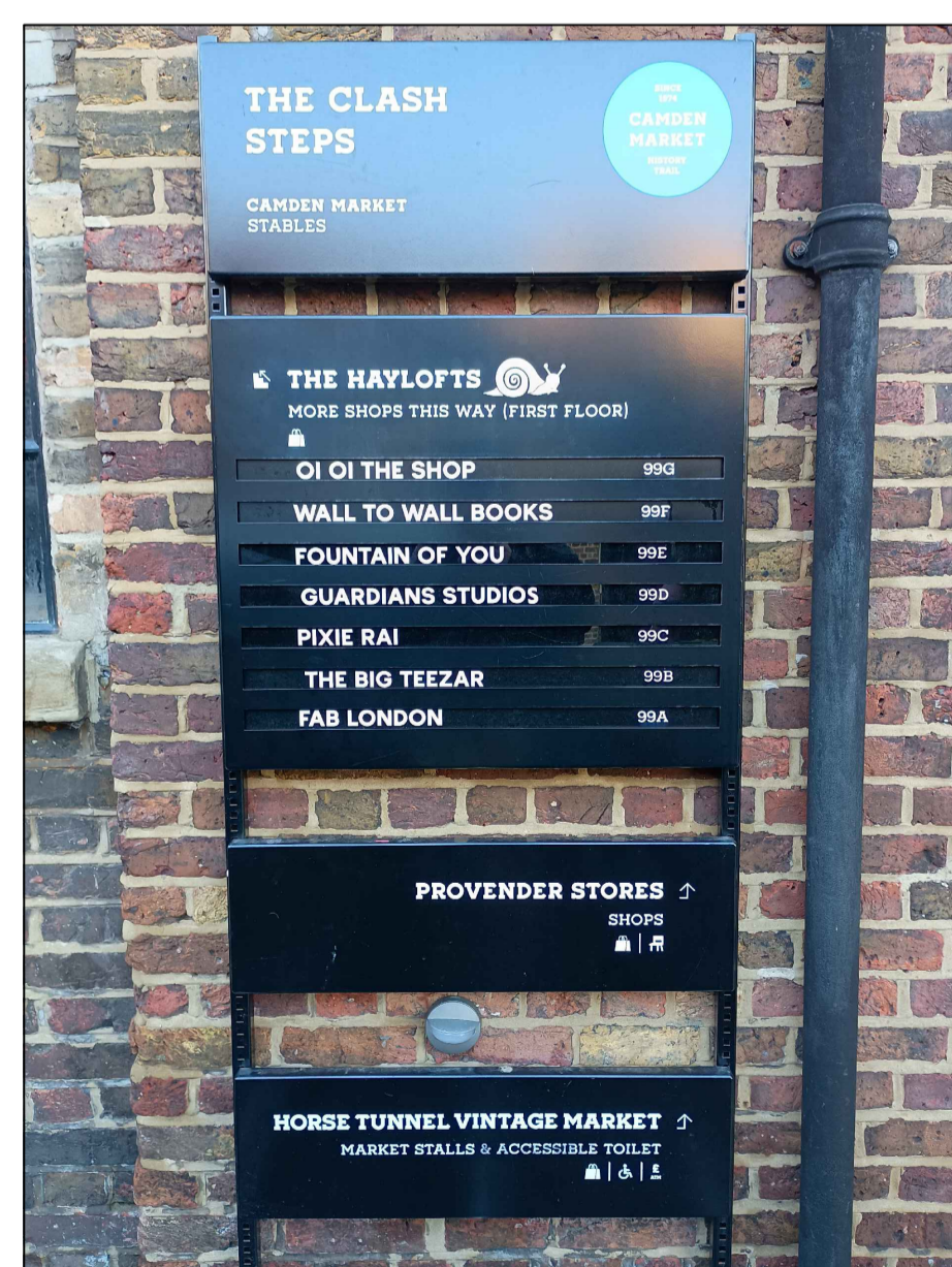
PH EXISTING SIGNAGE NTS