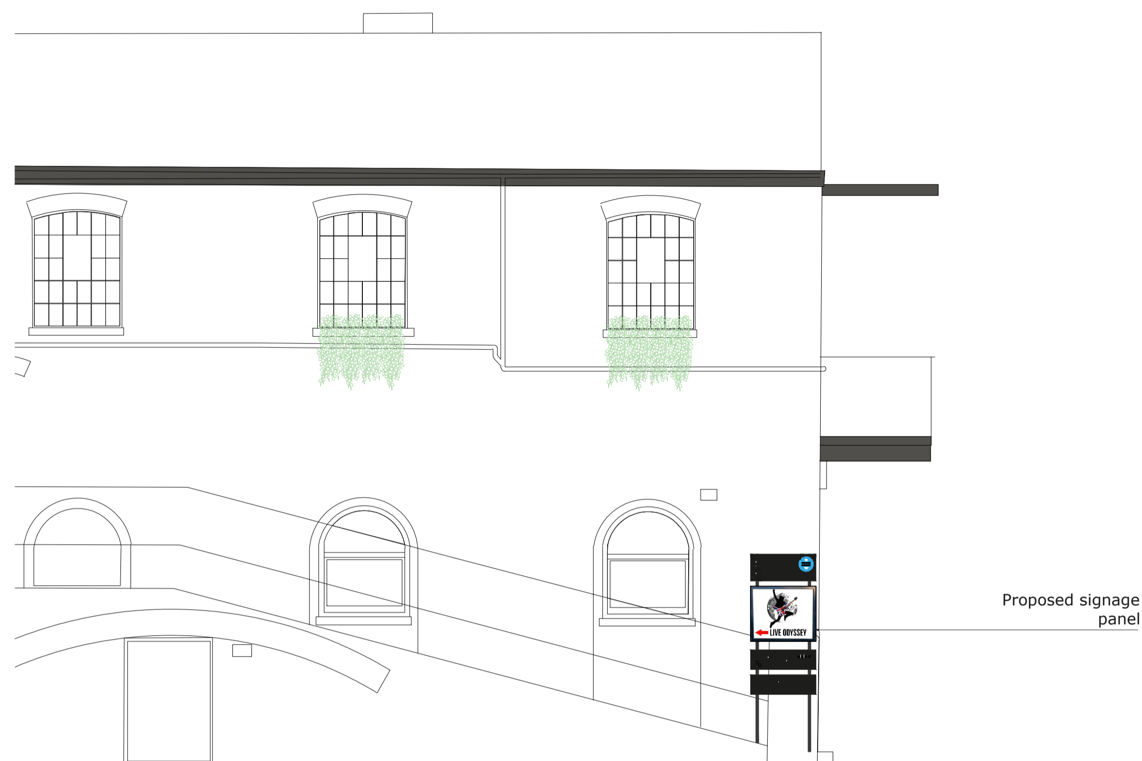
Proposed signage panel