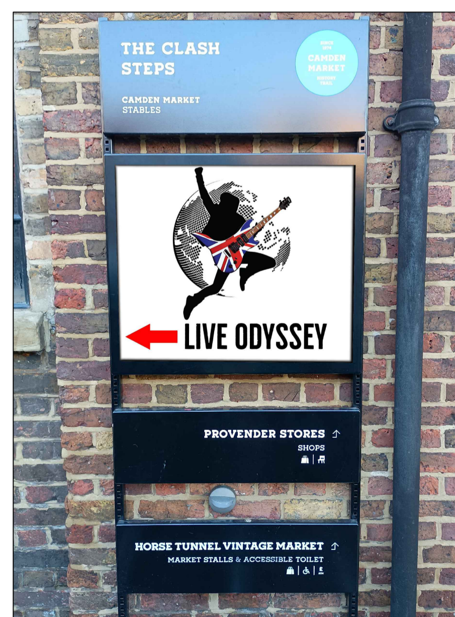
PH PROPOSED SIGNAGE NTS

THE PROPOSED SIGNAGE REPLACES THE EXISTING SIGNAGE FOR THE 7 SEPARATE UNITS AND IS THE SAME SIZE