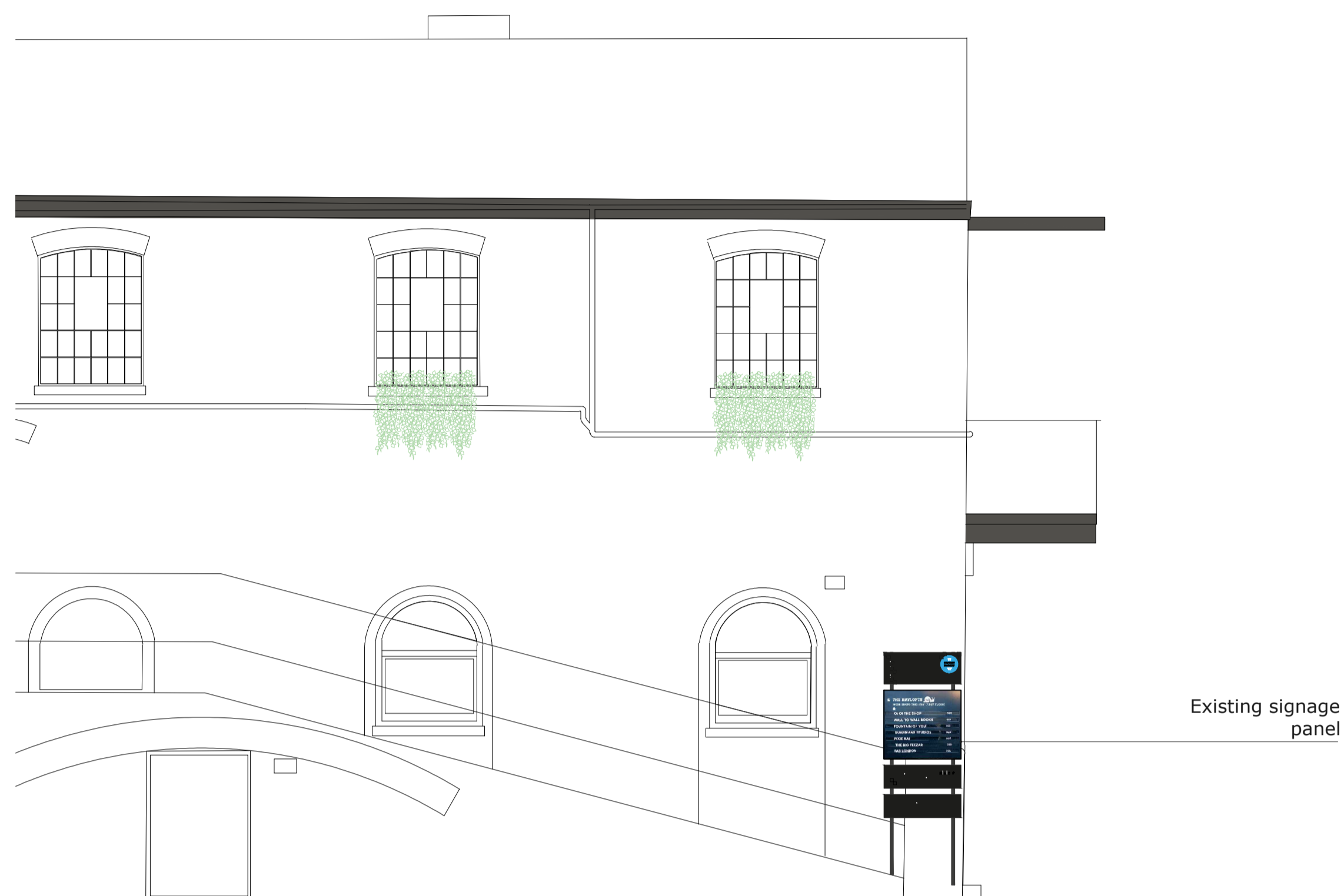
Existing signage panel