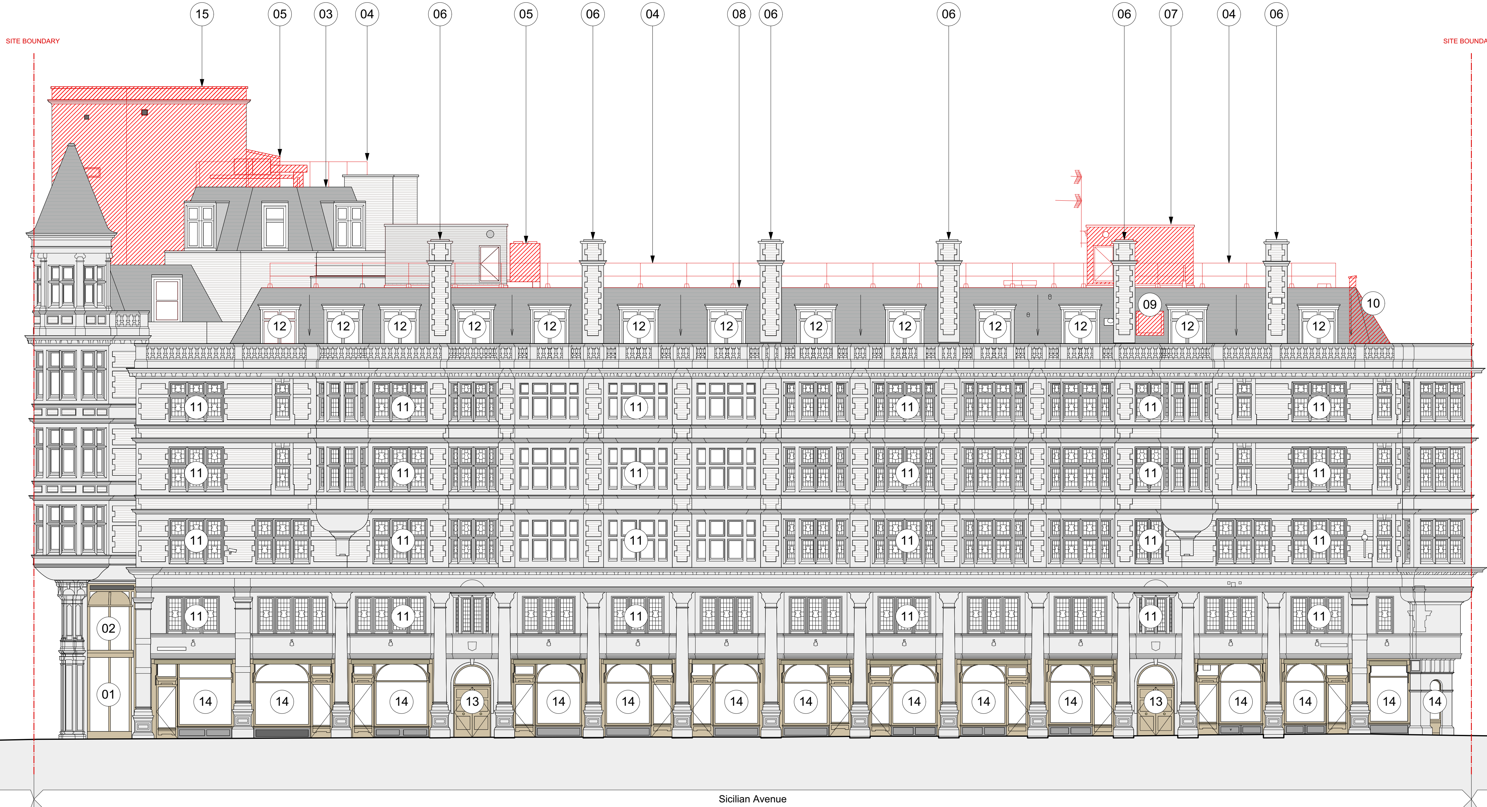
1 Vernon & Sicilian House Demolition North East Context Elevation Scale: 1:100