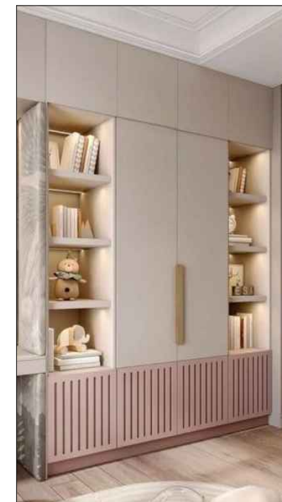
608.1 Wardrobe Concept Image NTS

KLD DESIGN INTENT ONLY DRAWING. PLEASE NOTE ALL DIMENSIONS ARE APPROXIMATE AND SUBJECT TO SITE SURVEY.