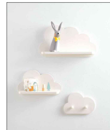
608.1 Wall shelves Concept Image NTS