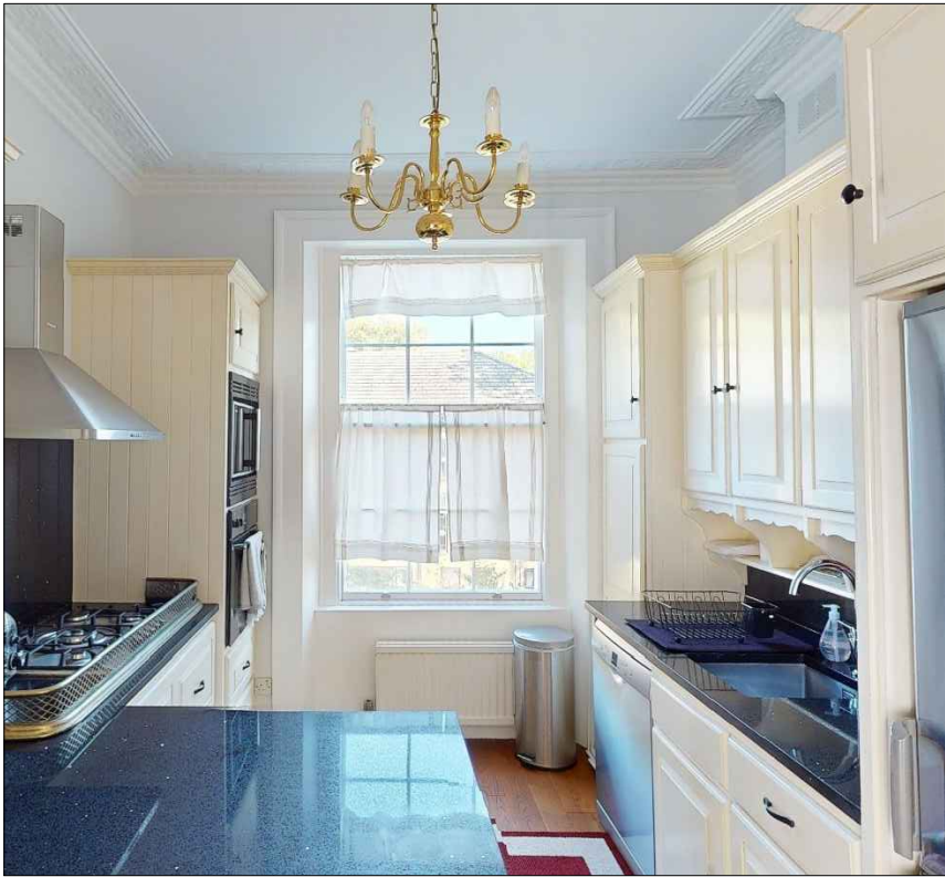
653.1 Existing Photo NTS