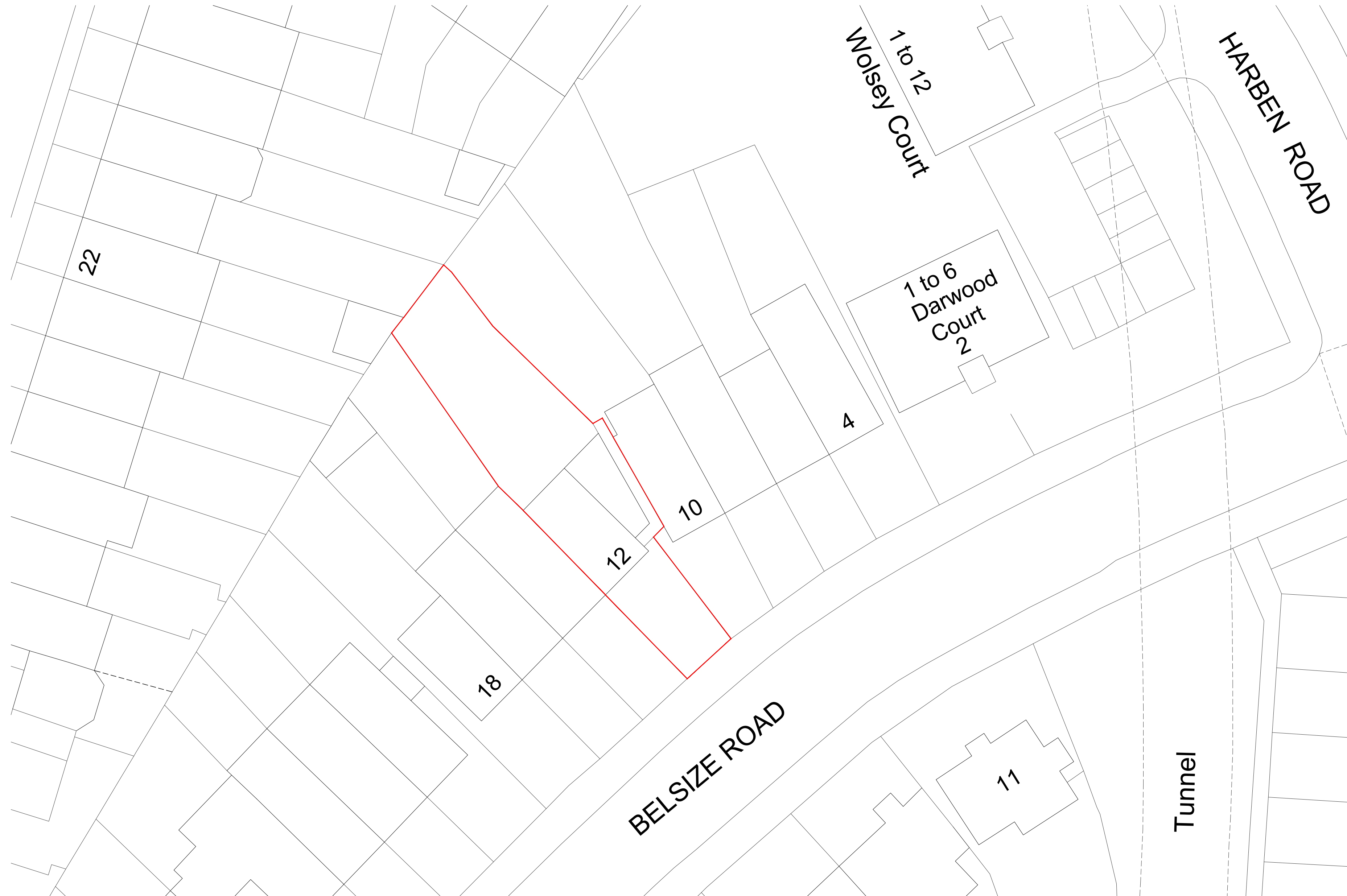
Existing Site | Block Plan 1:500 @ A3 | 1:250 @ A1 0 5m 10m 15m 20m