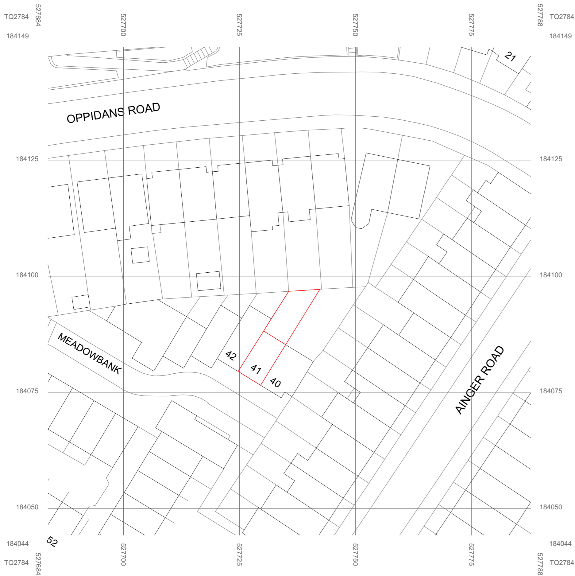
SITE LOCATION PLAN Scale @ 1:500