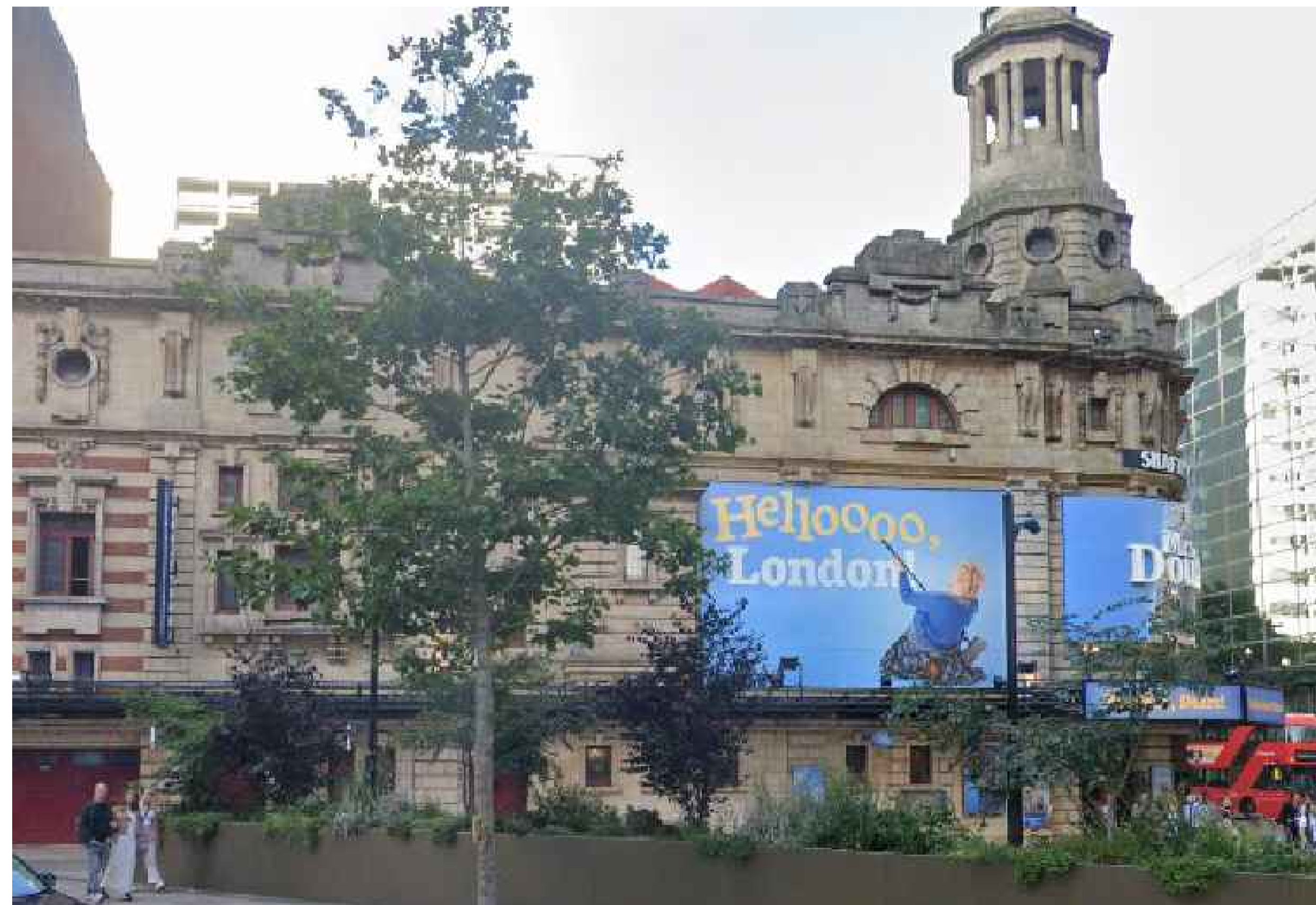
EXISTING PHOTOGRAPH OF BLOOMSBURY STREET EXTERNAL ELEVATION (NTS)