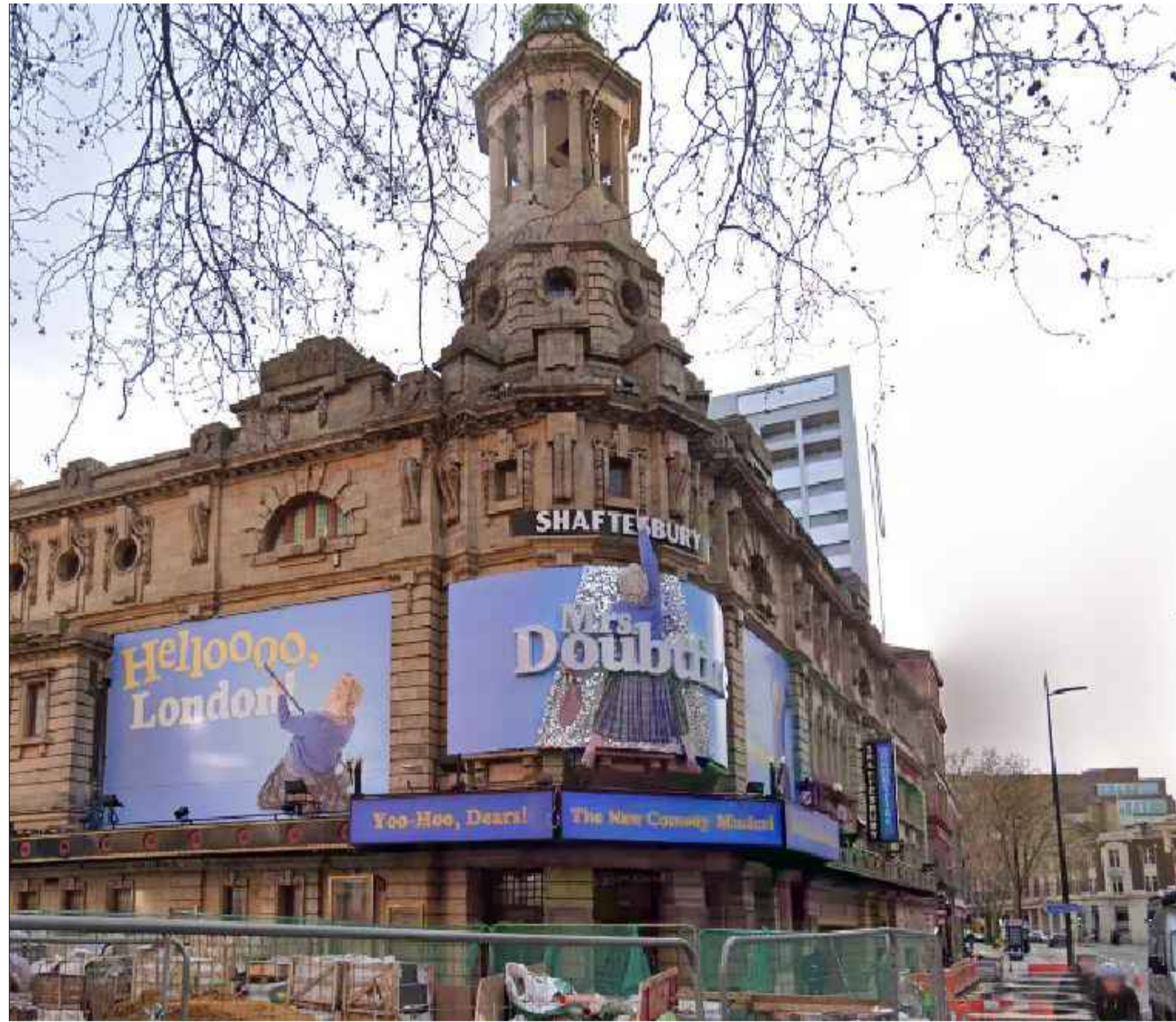
EXISTING PHOTOGRAPH OF THE MAIN ENTRANCE SHOWING BLOOMSBURY STREET AND HIGH HOLBORN EXTERNAL ELEVATIONS (NTS)