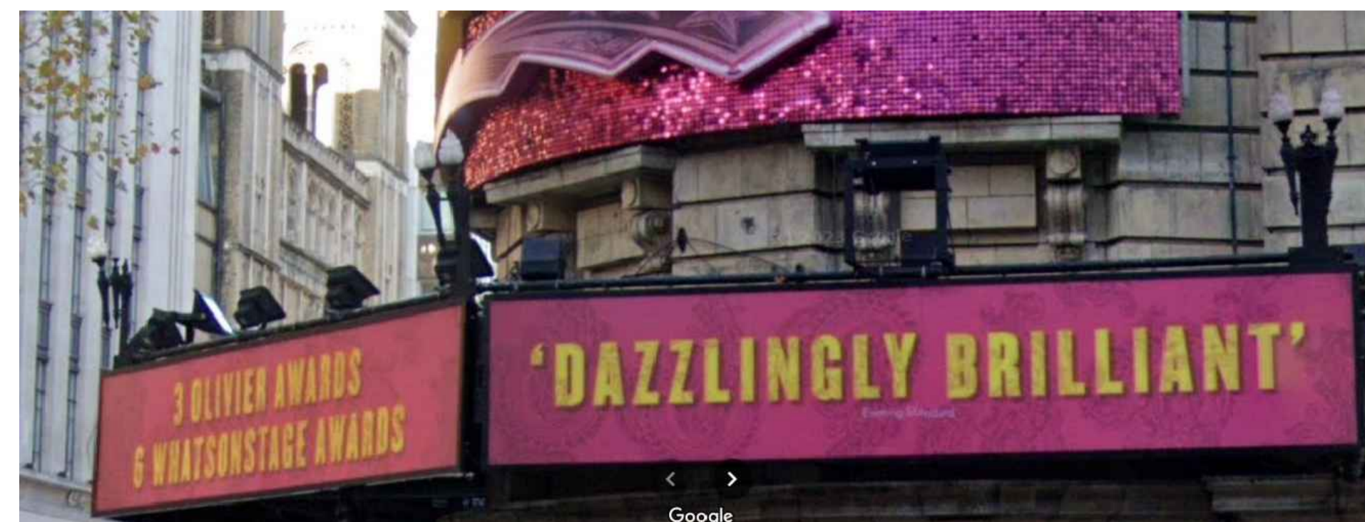
EXISTING PHOTOGRAPH OF CANOPY LIGHTING (NTS)