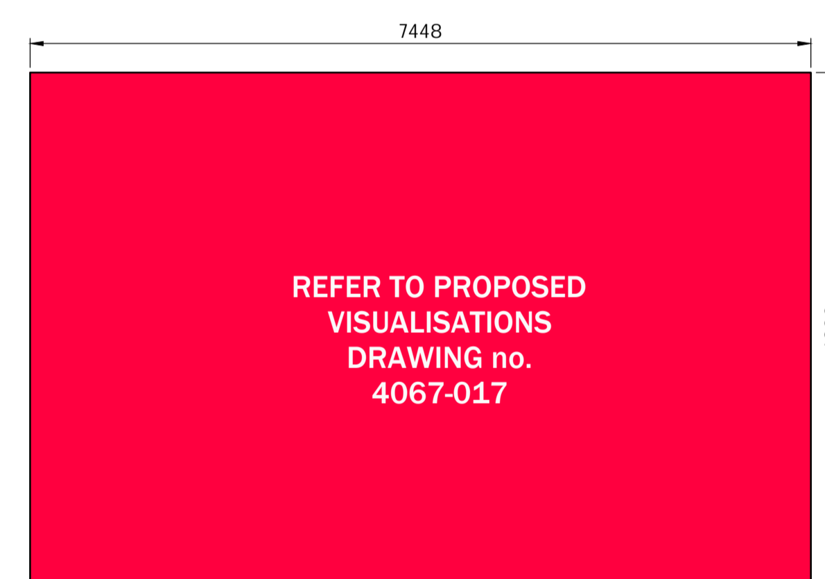
PROPOSED ELEVATION TO BLOOMSBURY STREET SIGNAGE (SCALE 1:50 AT A1)