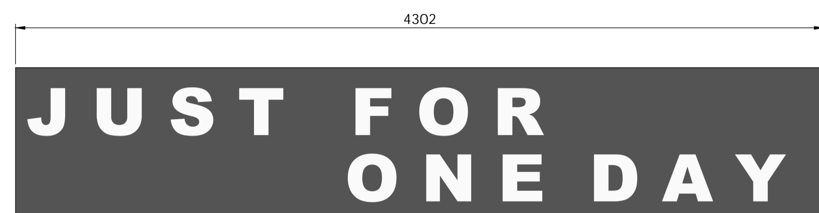
PROPOSED CANOPY SIGNAGE (SCALE 1:20 AT A1)

REFER TO DRAWING 4067-017 FOR PROPOSED VISUALS