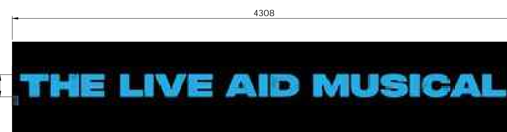
PROPOSED CANOPY SIGNAGE (SCALE 1:20 AT A1)