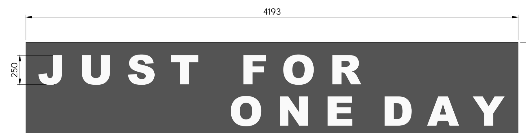
PROPOSED CANOPY SIGNAGE (SCALE 1:20 AT A1)