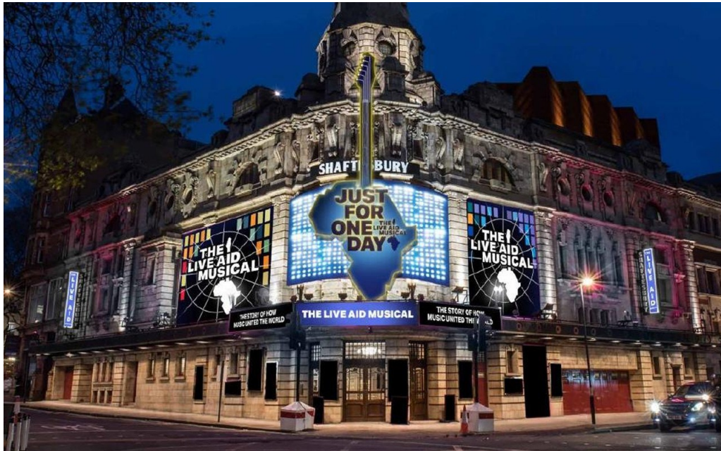
Proposed visualisation showing Bloomsbury Street and High Holborn elevations with new show-related graphics.