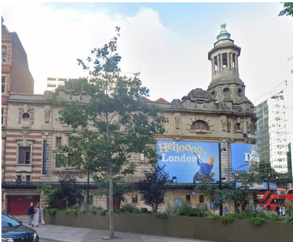
Existing photograph shows the Bloomsbury Street external elevation.