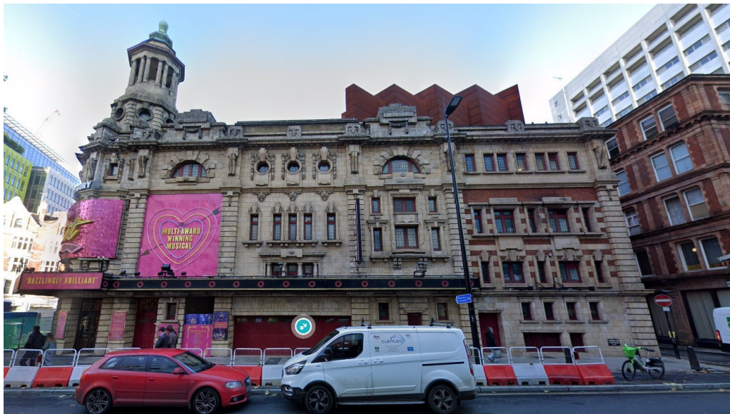
Existing photograph shows the High Holborn external elevation.