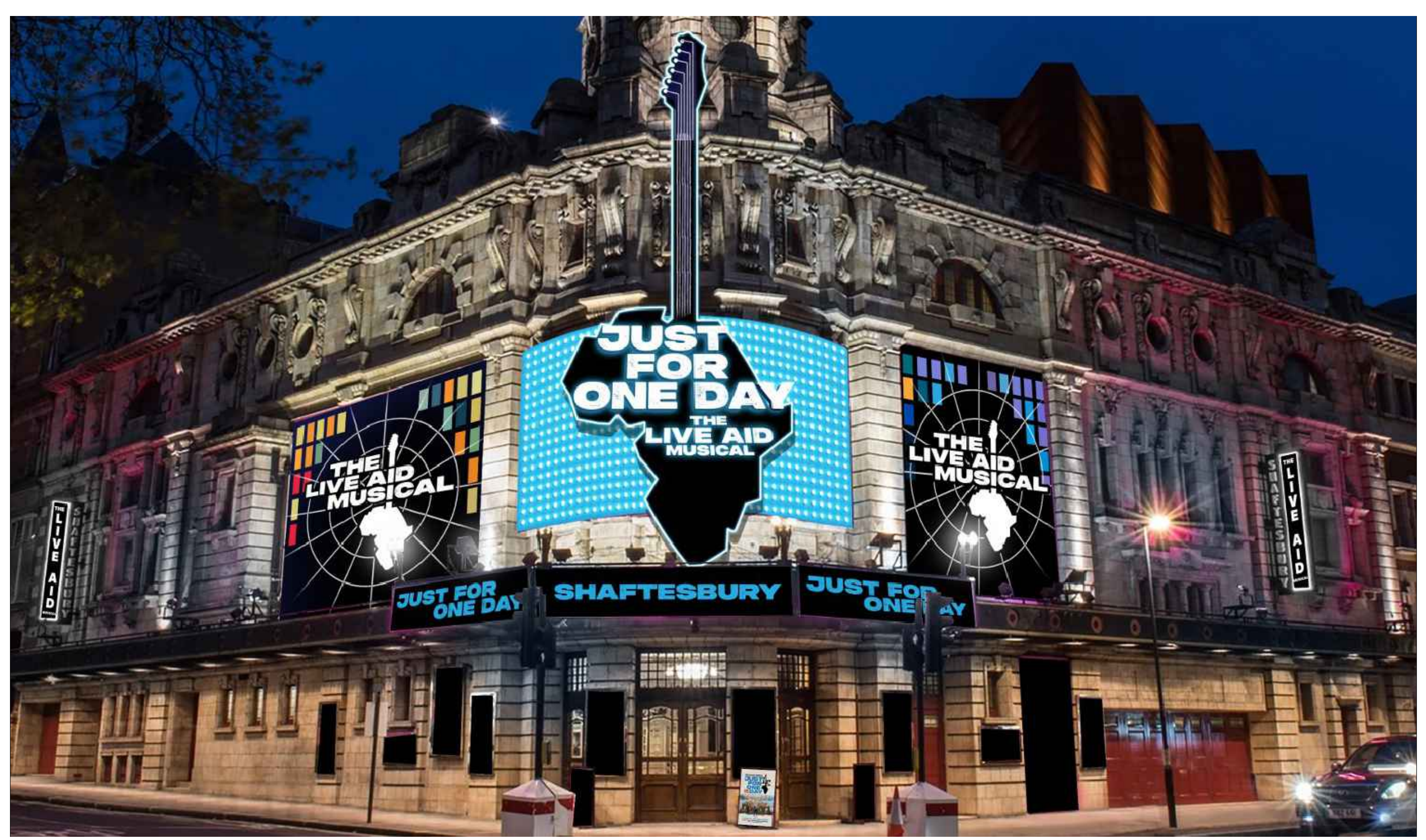
PROPOSED OPTION 1- VISUALISATION OF THE MAIN ENTRANCE SHOWING BLOOMSBURY STREET /HIGH HOLBORN EXTERNAL ELEVATIONS WITH SHAFTESBURY SIGNAGE REMOVED (NTS)