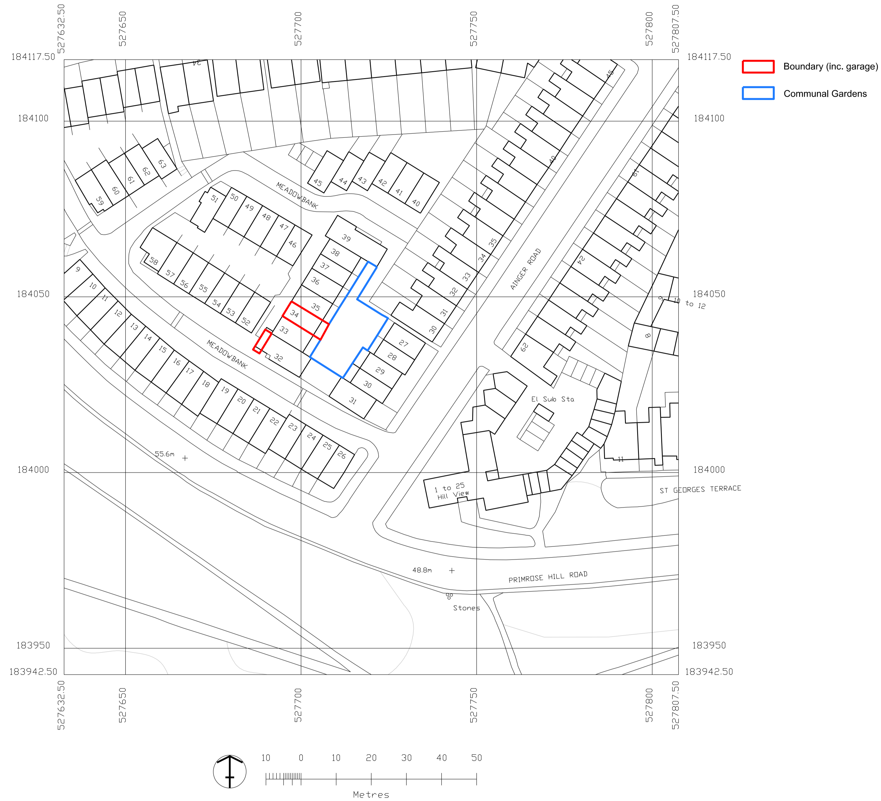
01 Location Plan Scale 1:625 @A1 / 1:1250 @A3