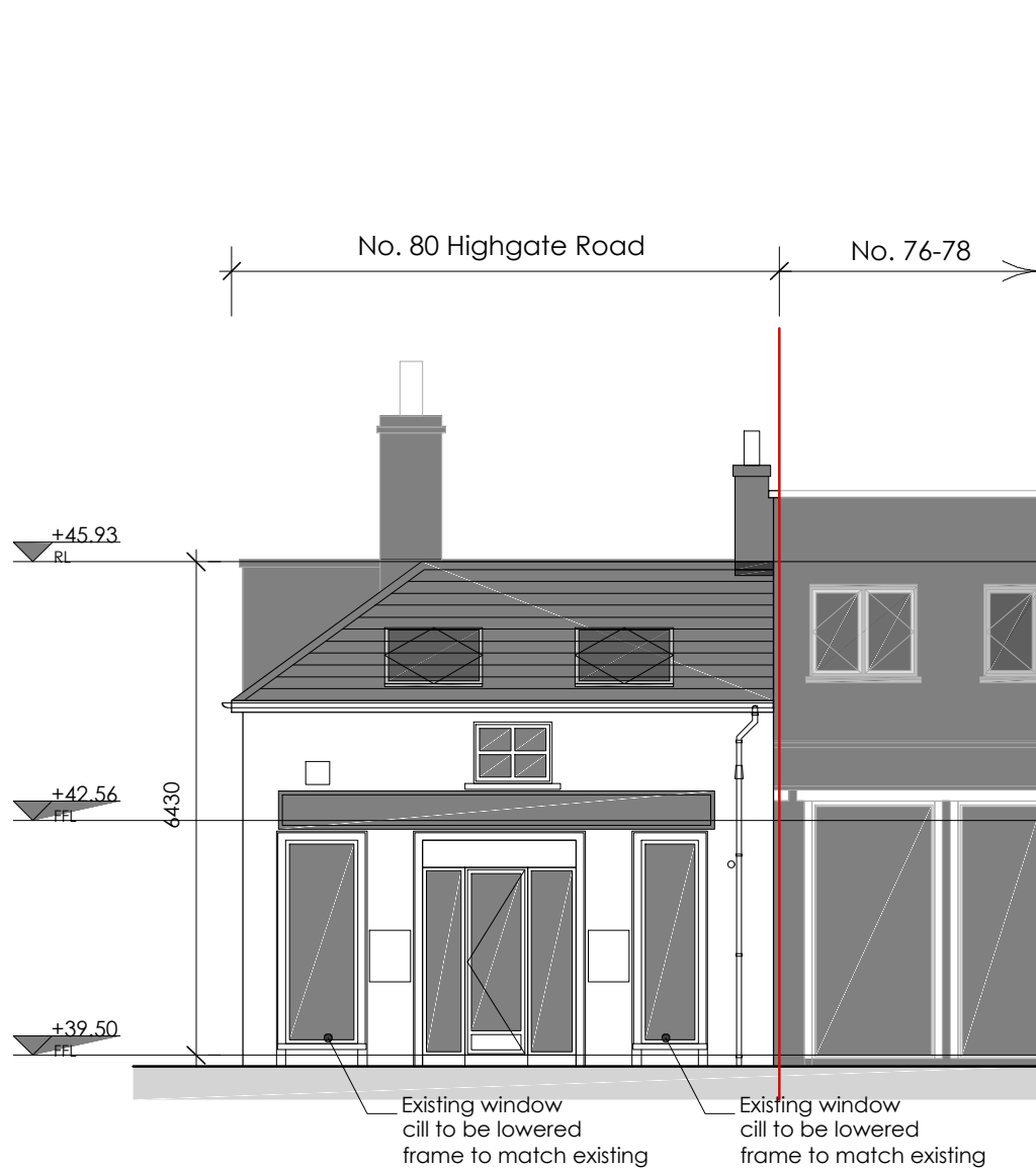
1 Proposed Front Elevation Scale: 1:100