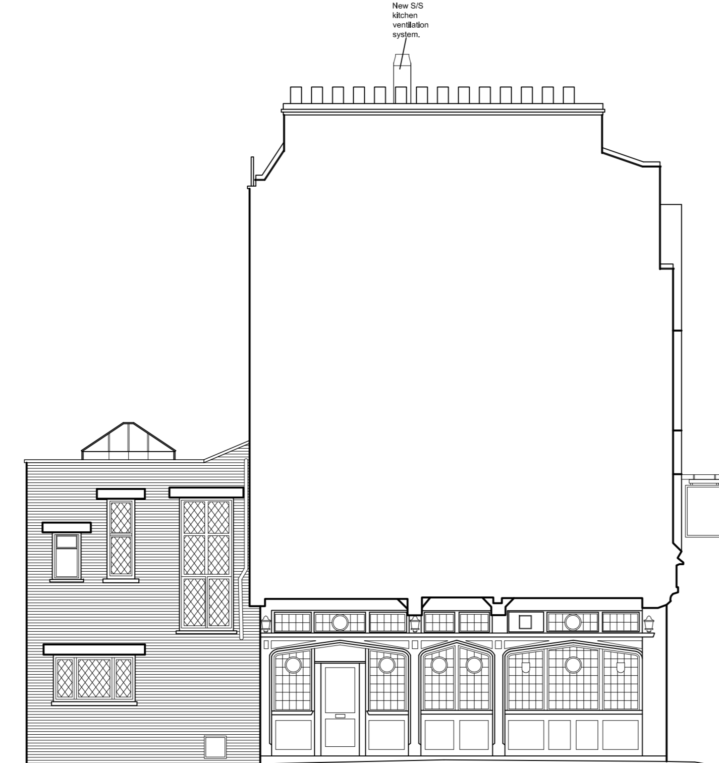
Proposed North West Elevation