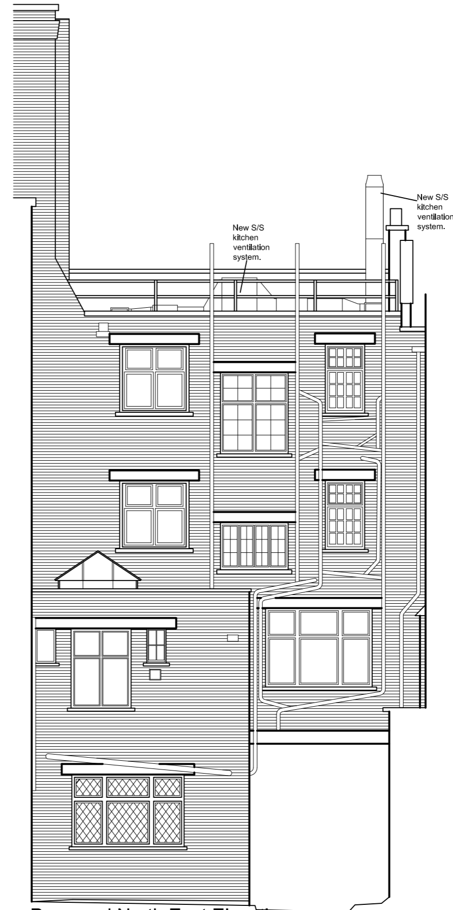
Proposed North East Elevation