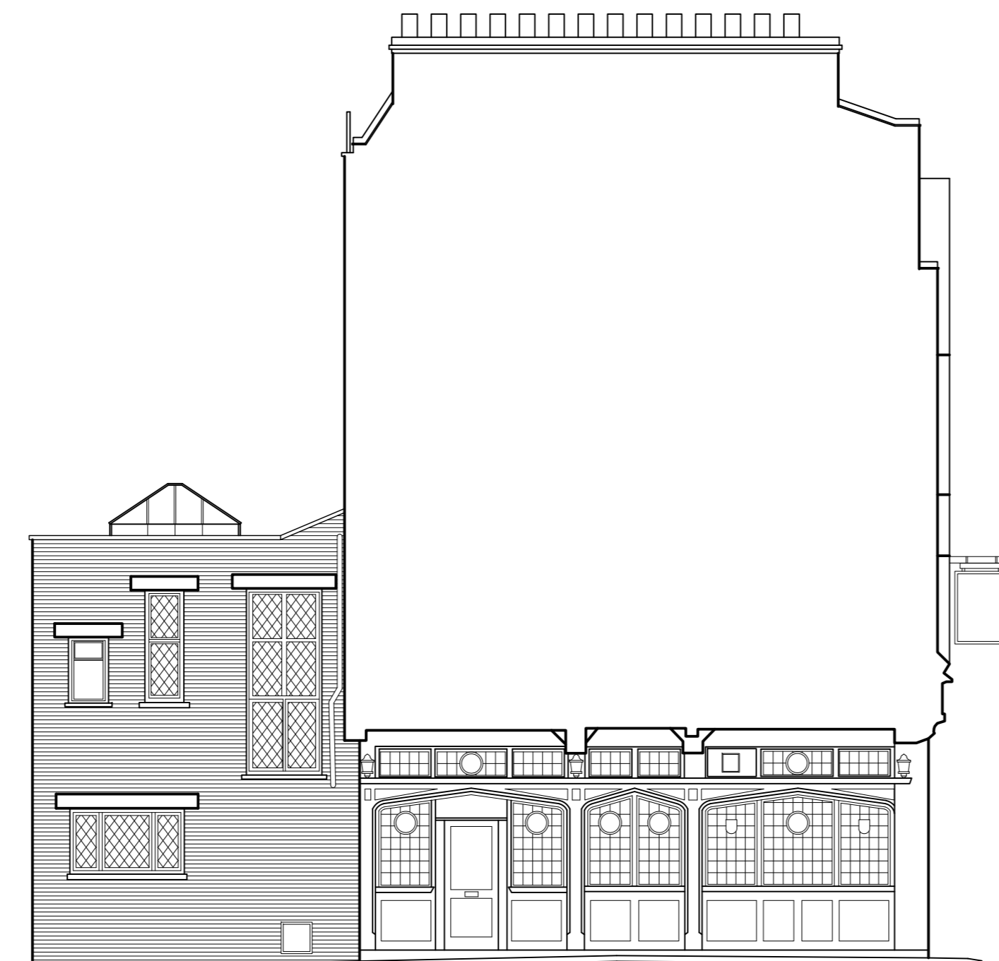
Existing North West Elevation