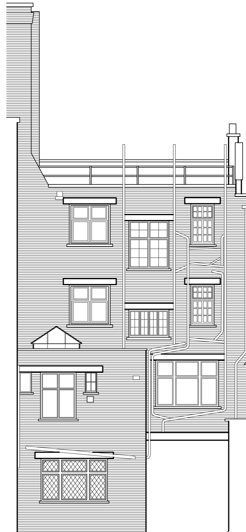
Existing North East Elevation