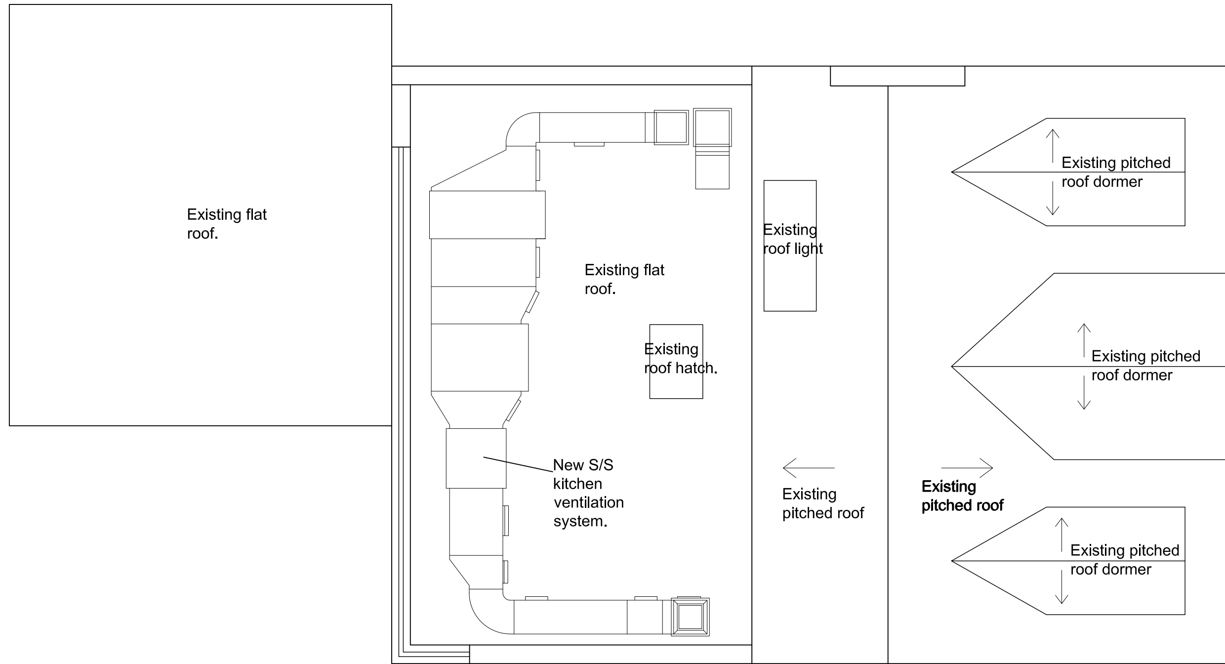
Proposed Roof Plan

51 - 55 Fowler Road Hainault Essex IG6 3XE Tel: 020 8559 8666 Fax: 020 8559 8777