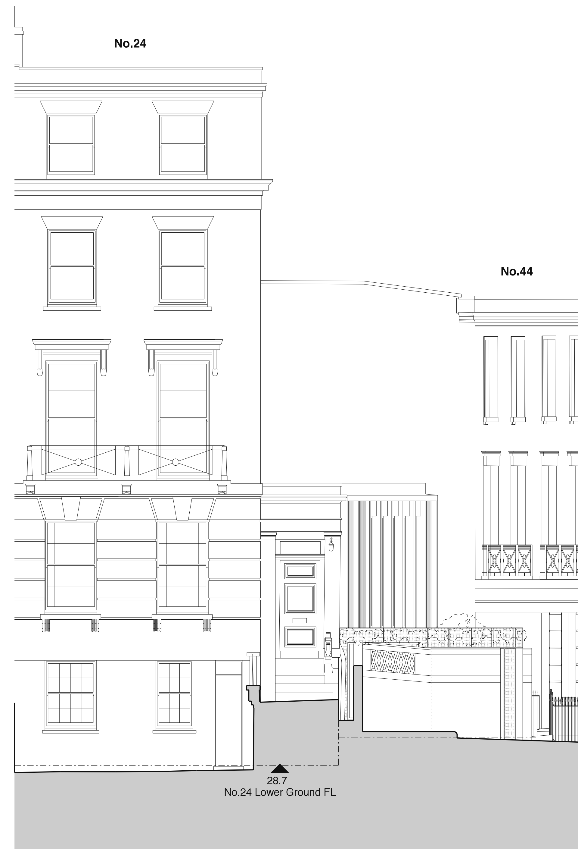
Elevation 02 - Gloucester Crescent