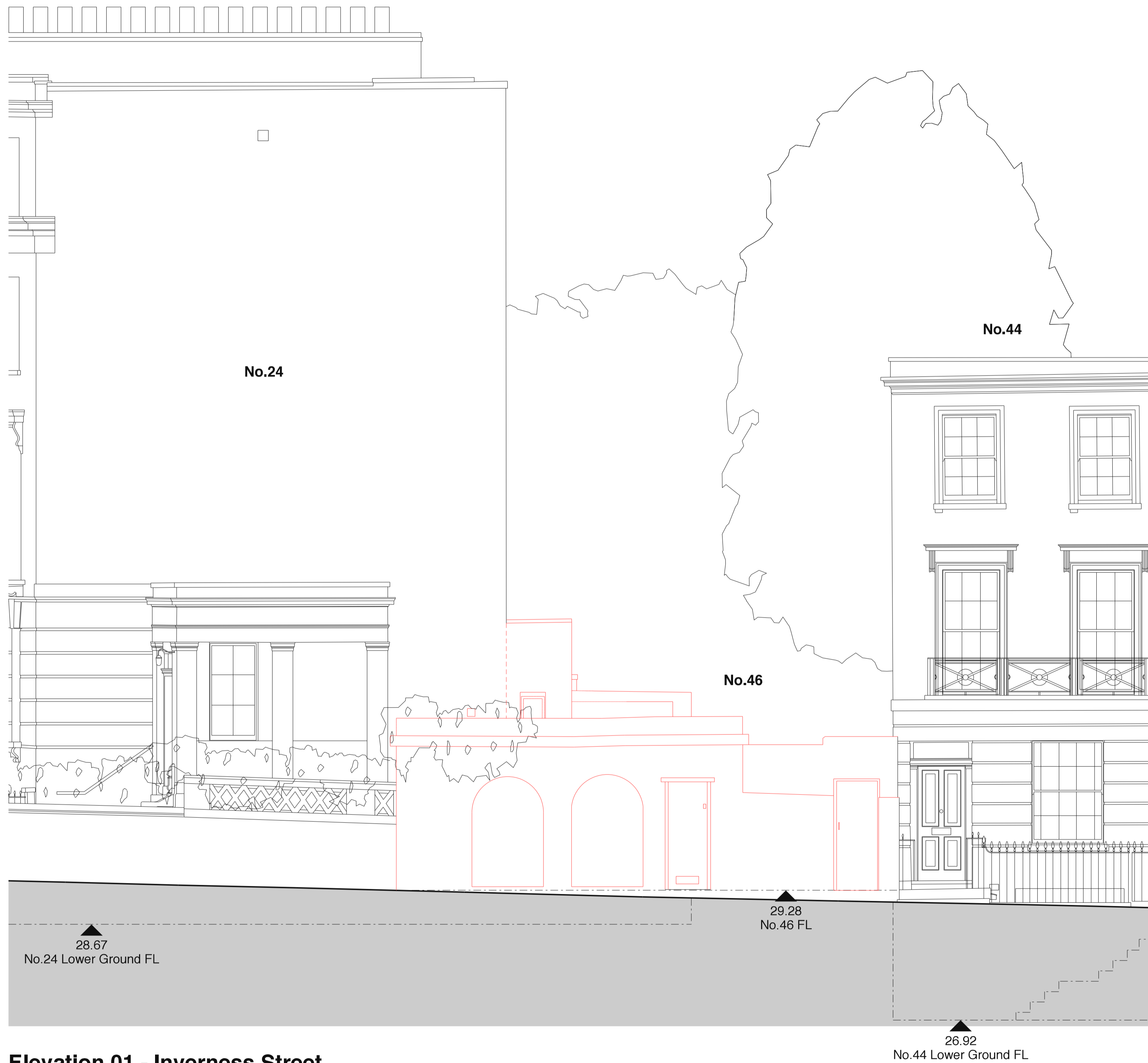
Elevation 01 - Inverness Street