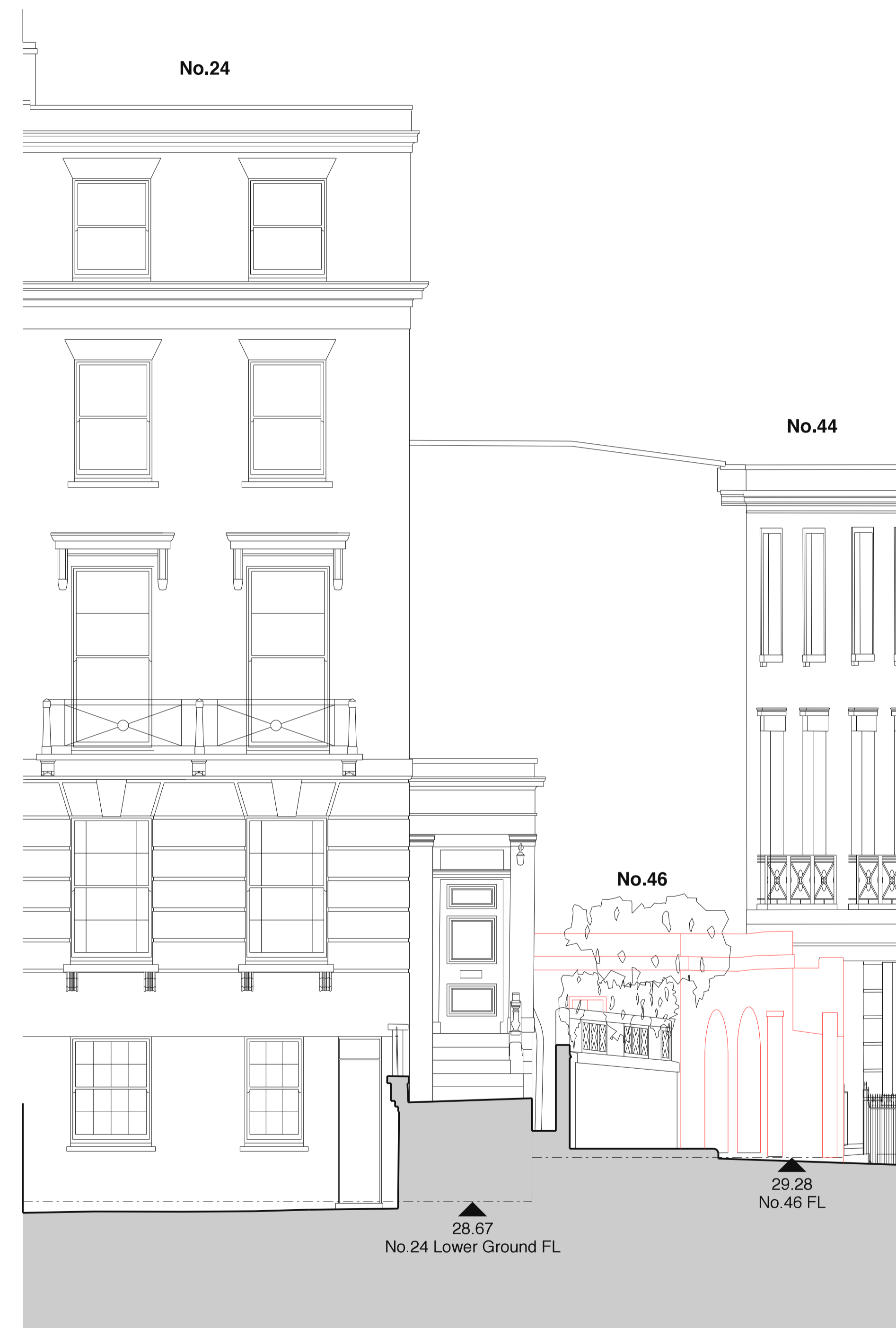
Elevation 02 - Gloucester Crescent