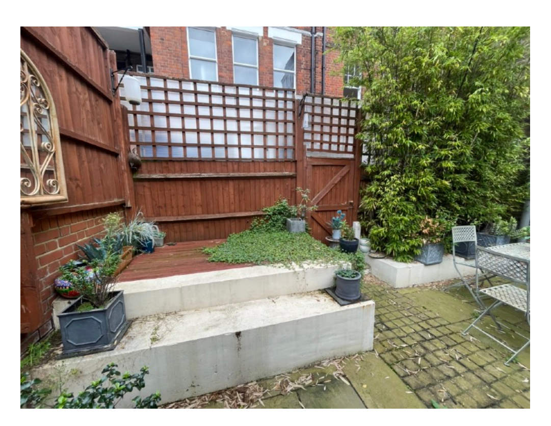
[8] Rear Garden