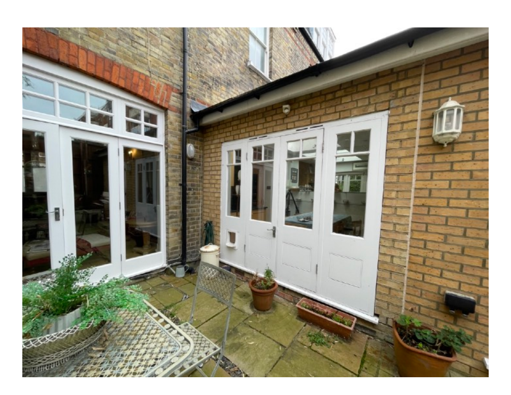
[6] Rear Elevation: French doors to existing rear extension