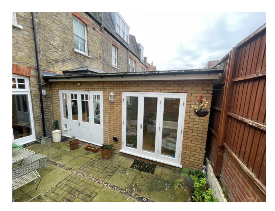
[7] Rear Elevation: Existing rear extension