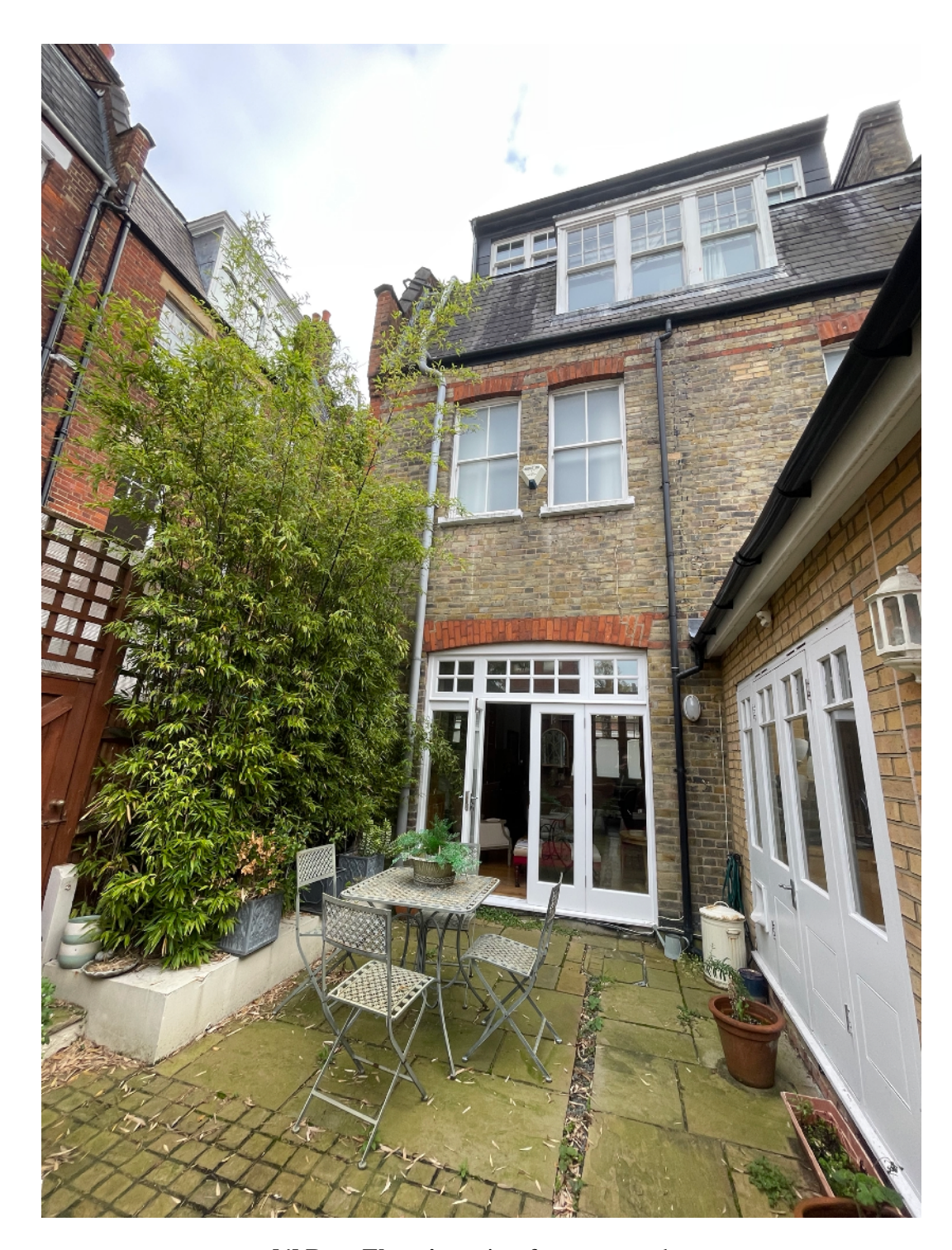
[4] Rear Elevation: view from rear garden