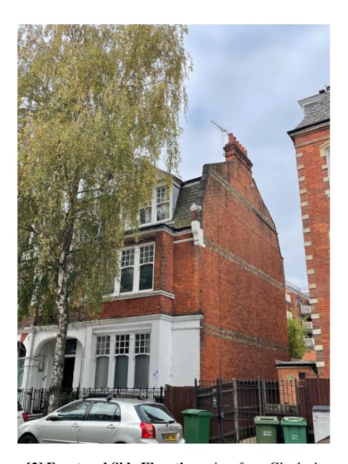
[2] Front and Side Elevation: view from Glenloch Road