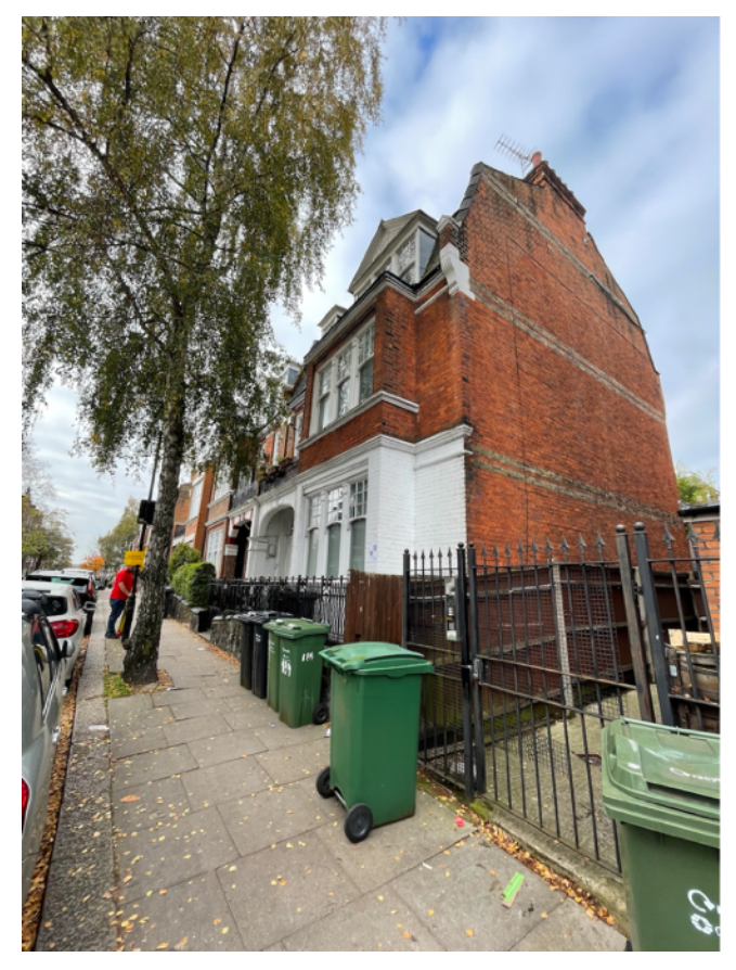
[3] Side Elevation: view from Glenloch Road