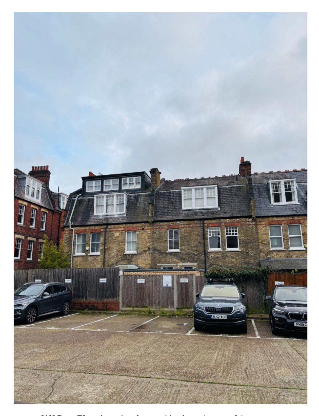
[10] Rear Elevation: view from parking lot at the rear of the property