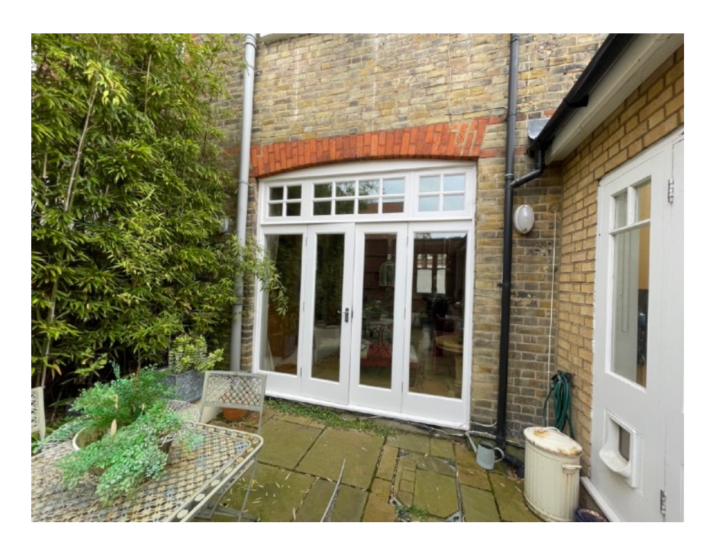
[5] Rear Elevation: French doors to Dining Room