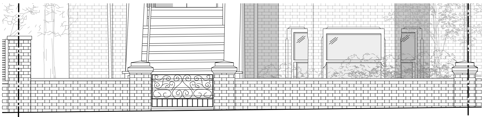
2 EXISTING ELEVATION AA 1:50 @ A3