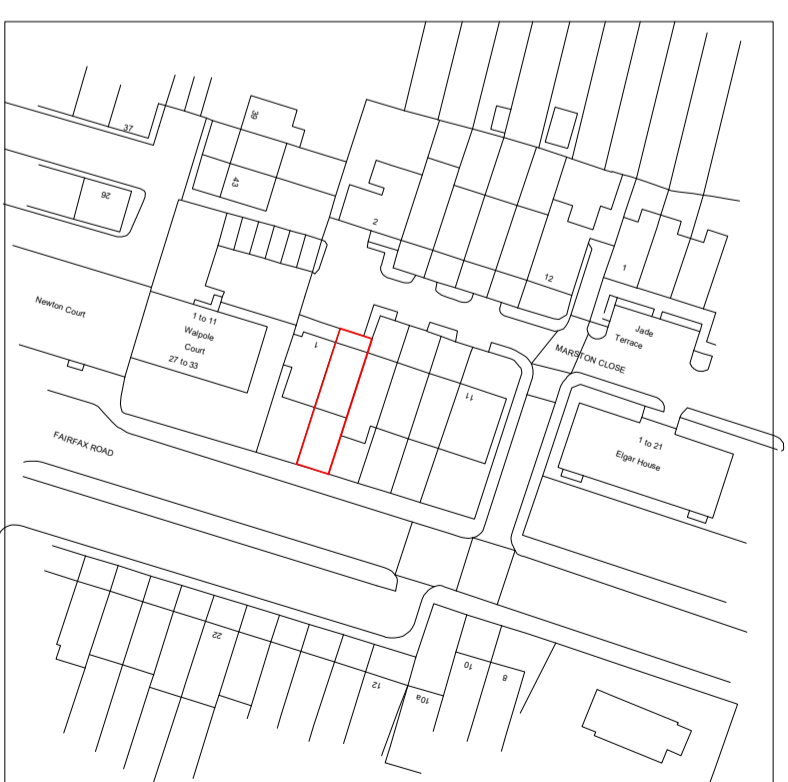
SITE PLAN 1:1250