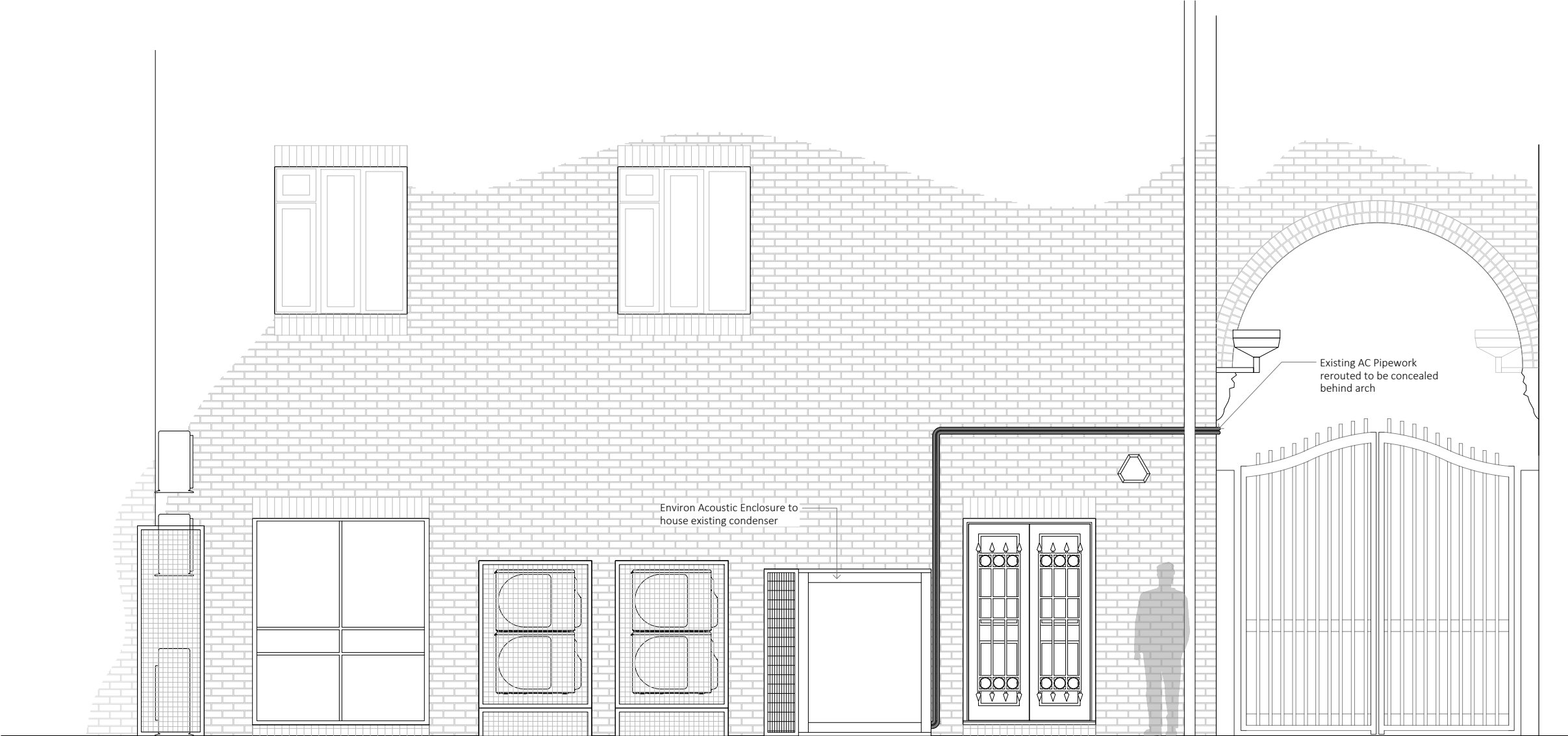
7-8 Mathews Yard Elevation