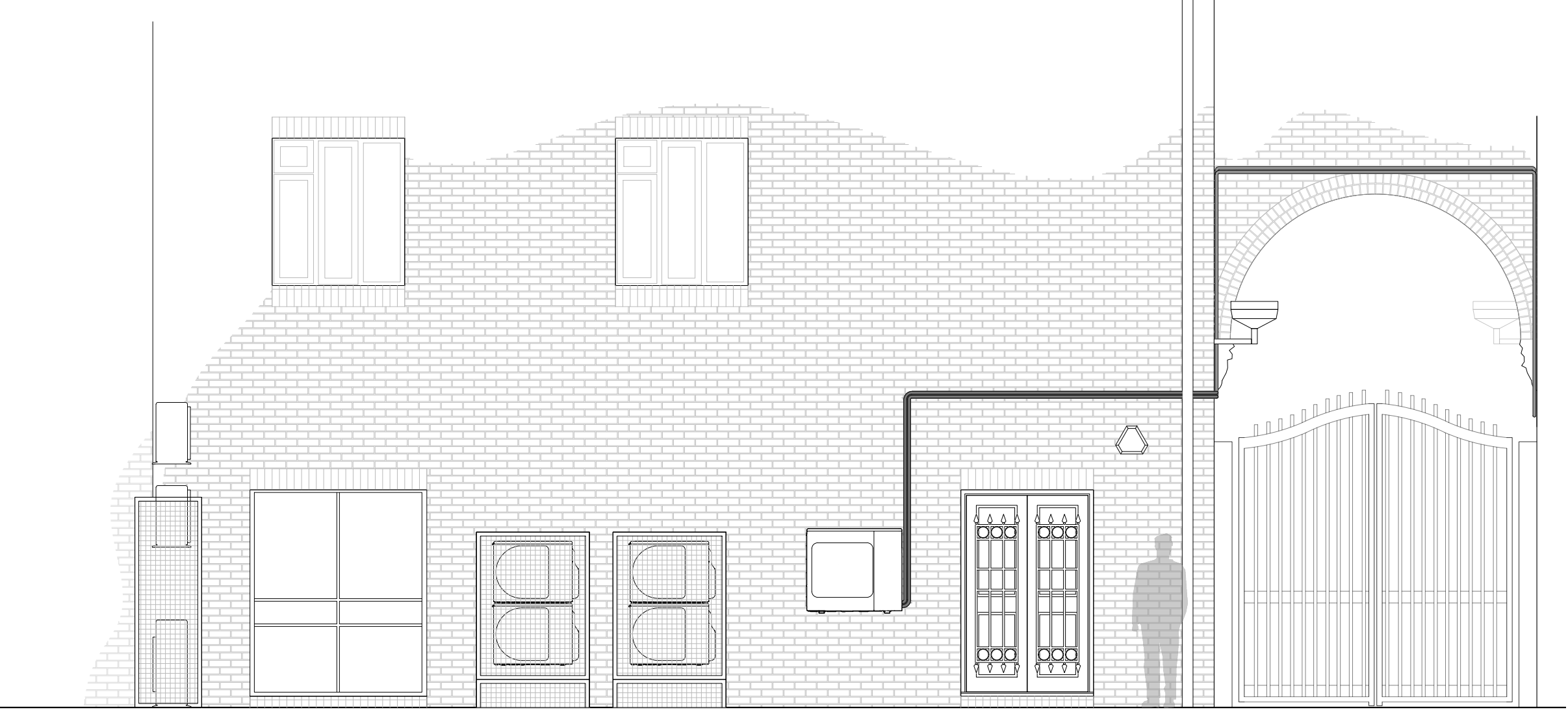
7-8 Mathews Yard Elevation