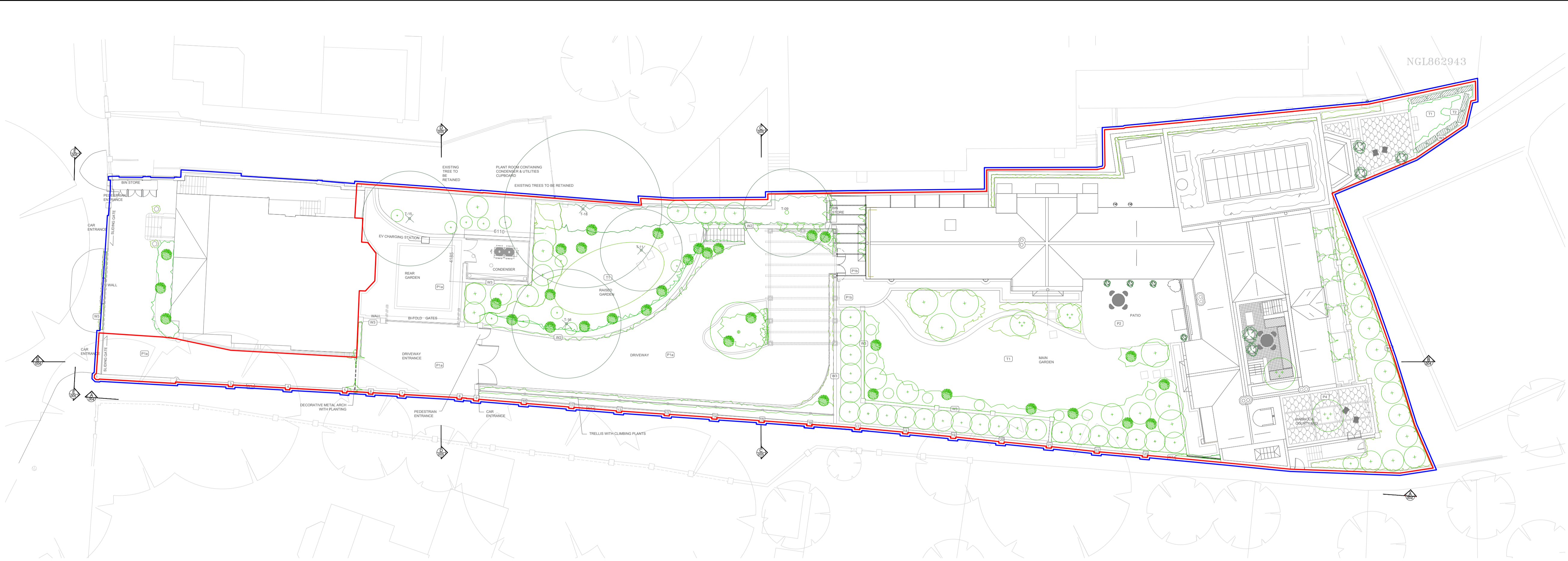
A-046-003 GENERAL ARRANGEMENT CHANGES PLAN: PROPOSED 01 1:200@A1