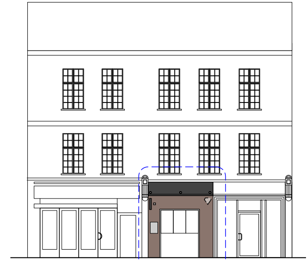
1 KEY ELEVATION - ENDELL STREET Scale: 1:200