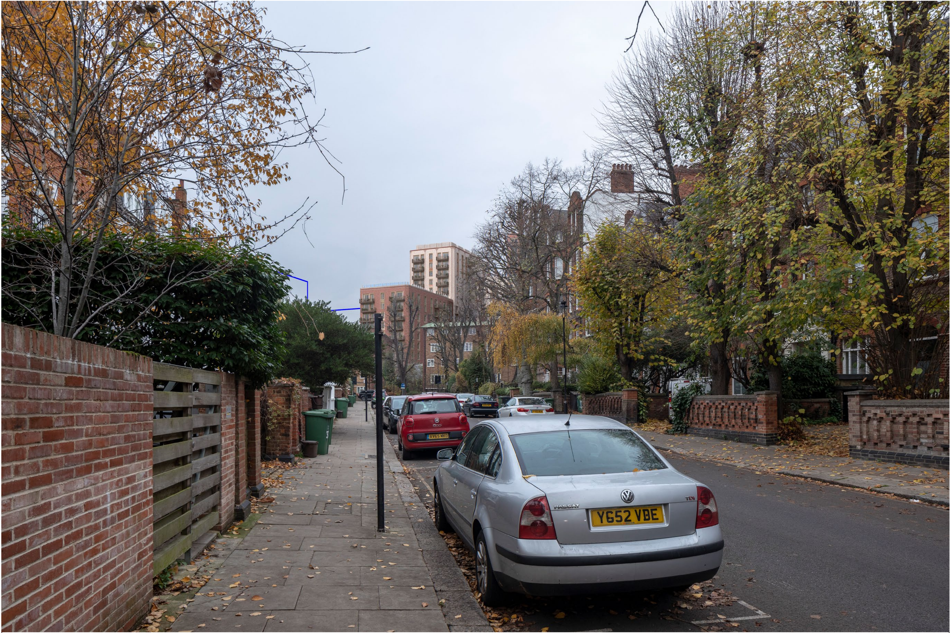
24mm – 36.9° 35mm – 27.2° 50mm – 19.8° Image scalling factor = 37% at A3, 105% at A0 50mm – 19.8° 35mm – 27.2° 24mm – 36.9°