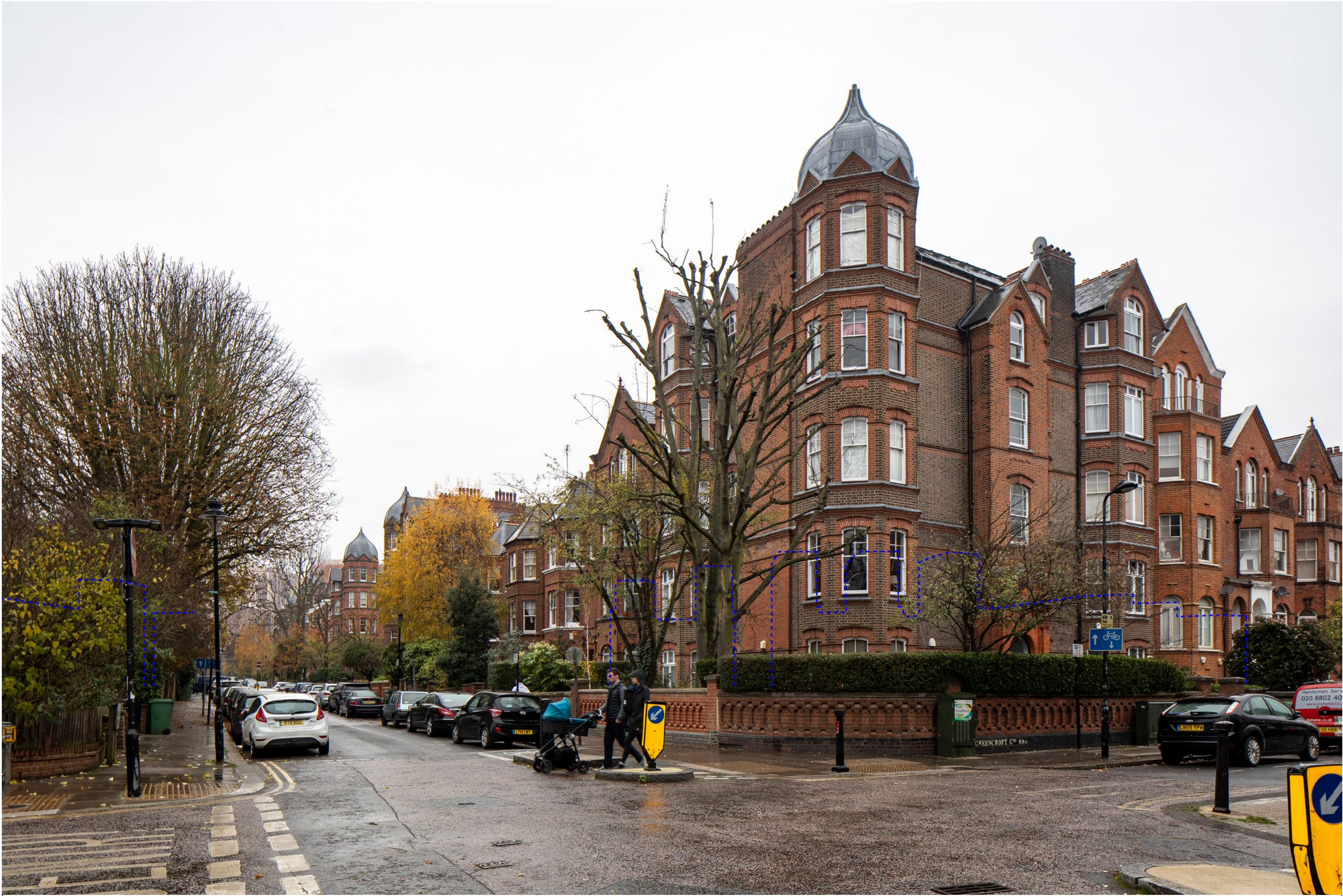
24mm – 36.9° 35mm – 27.2° 50mm – 19.8° Image scalling factor = 37% at A3, 105% at A0 50mm – 19.8° 35mm – 27.2° 24mm – 36.9°