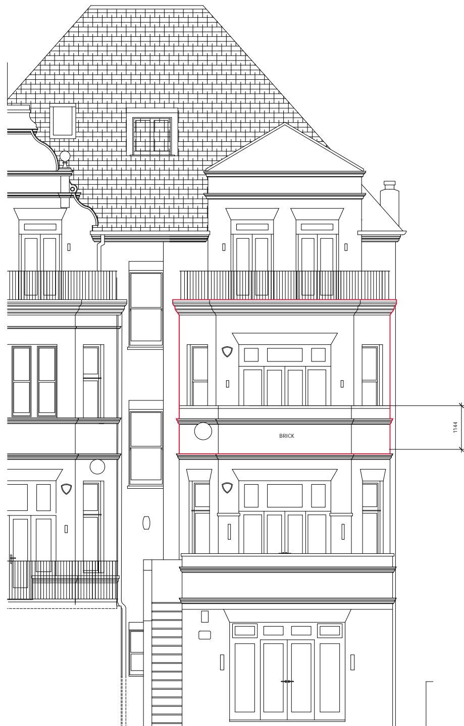
2 ETON AVENUE - EXISTING REAR ELEVATION BALCONY Scale: 1:50