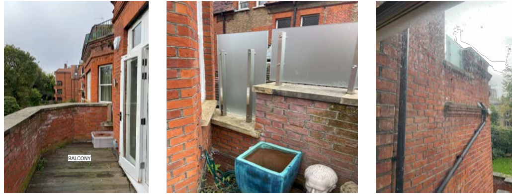
4 ETON AVENUE - EXISTING REAR BALCONY IMAGES Scale: Actual Size