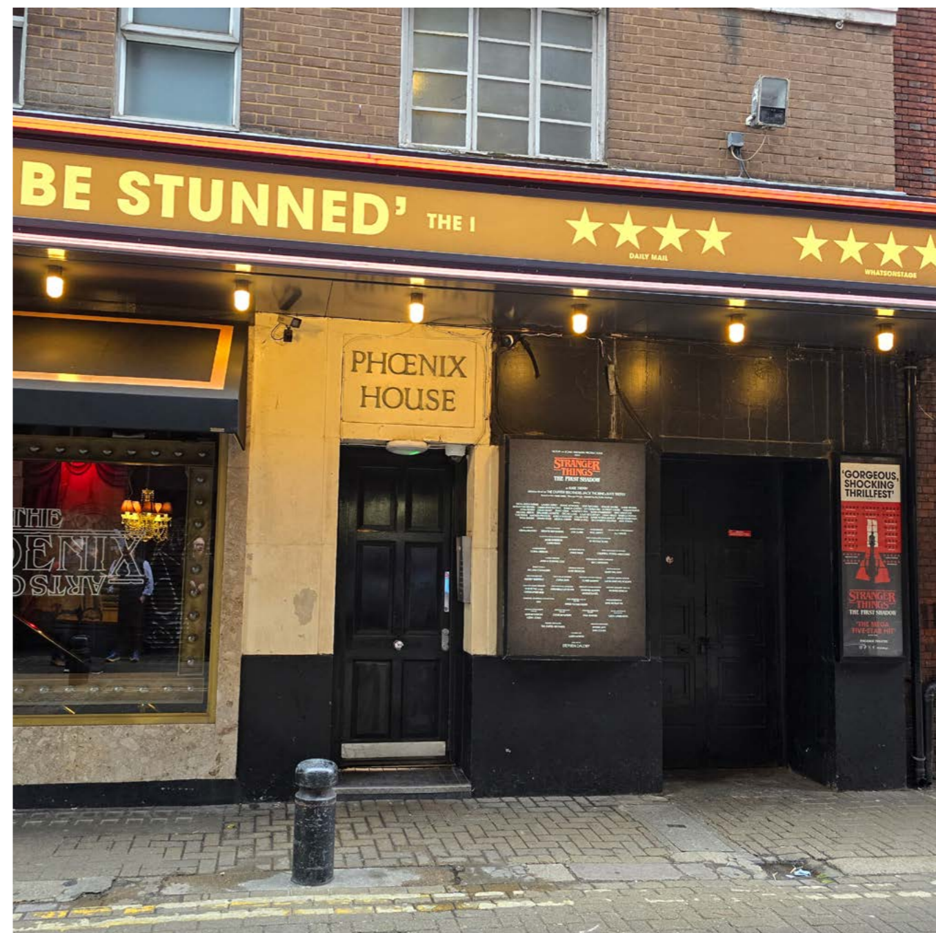
Existing view of entrance