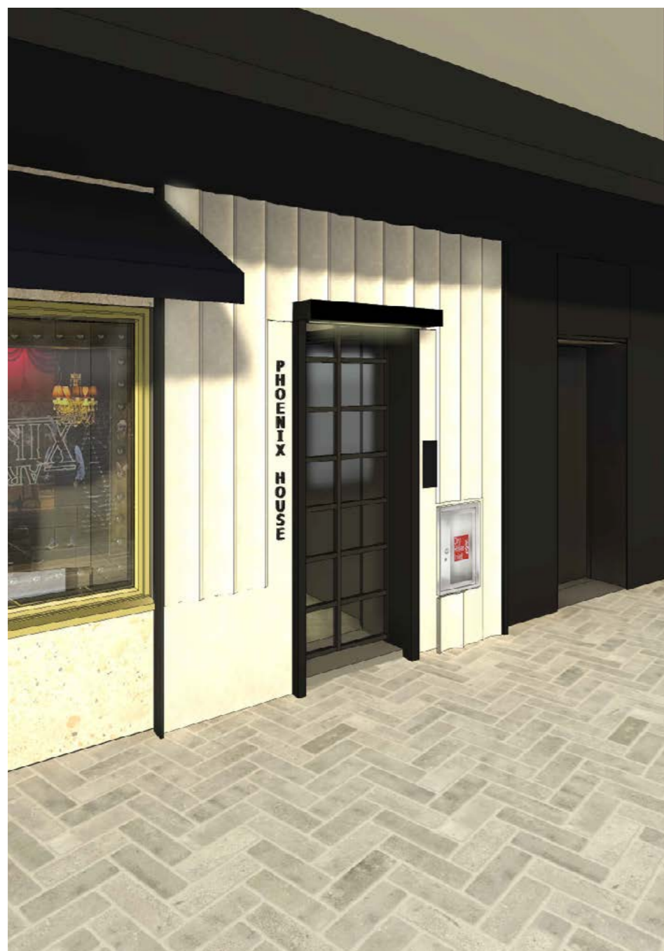
Exterior visual of the residential entrance on Phoenix Street