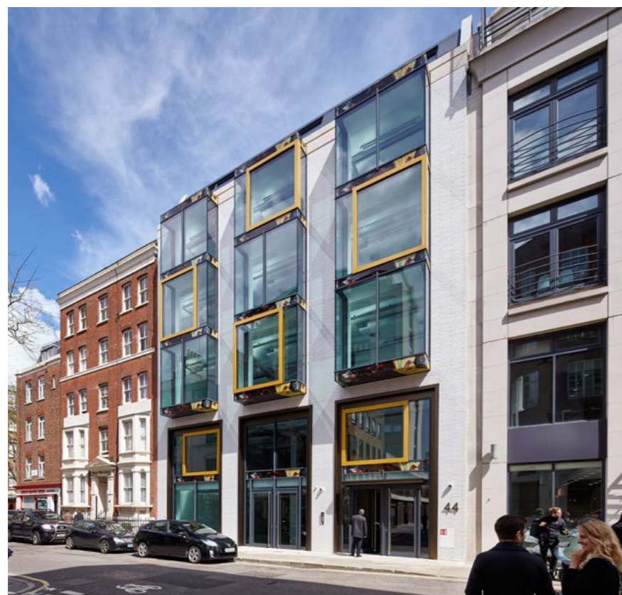
bMc reference - 44 Whitfield Street, complete

Brimelow McSweeney Architects are an award winning architects practice based in London. We specialise in community, residential, commercial and leisure schemes and have earned an excellent reputation for delivering high quality design.