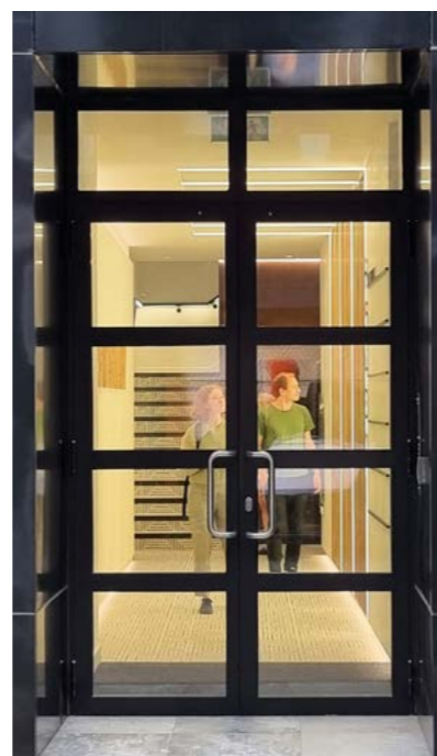
Reference Images of glazed terracotta cladding and framed glass entrance doors