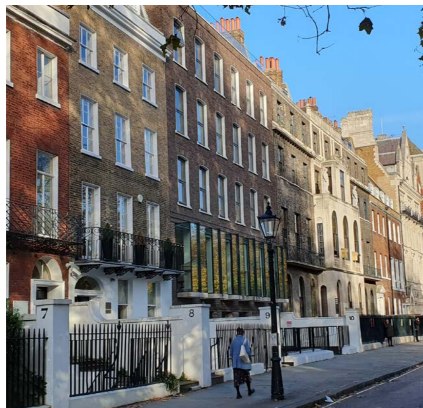
bMc reference - 10-11 Lincoln's Inn Fields, complete