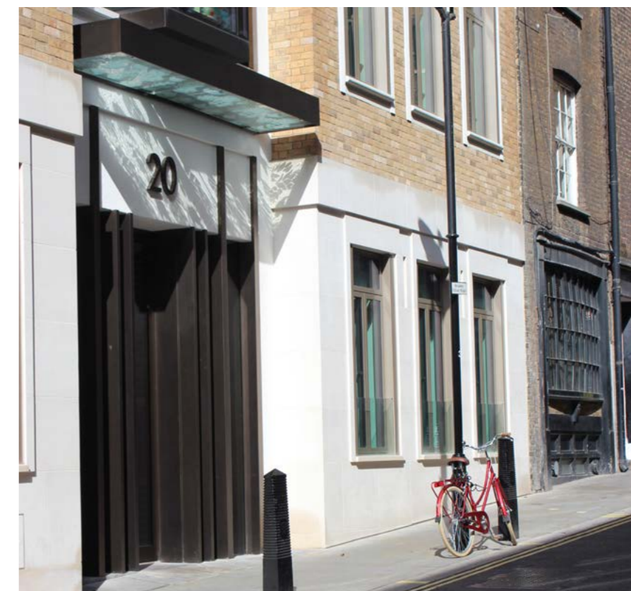
bMc reference - 20 Bedfordbury, Covent Garden, complete