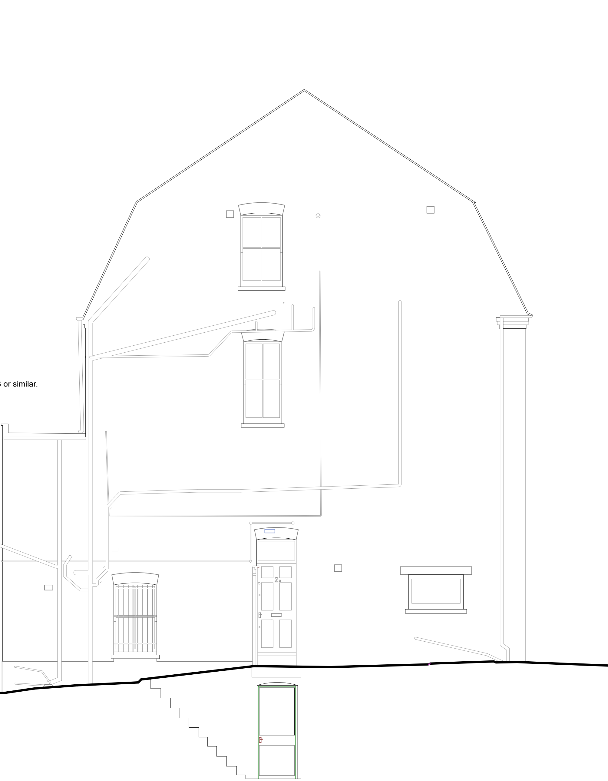
02 Proposed Side Elevation