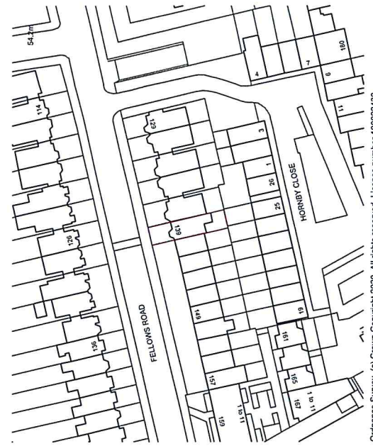
Location Plan scale: 1250@A3