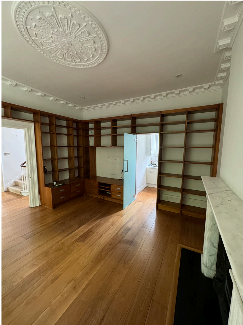
Existing ground floor dining room