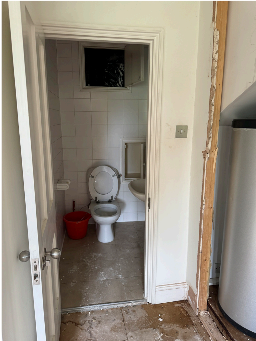
Existing third floor toilet