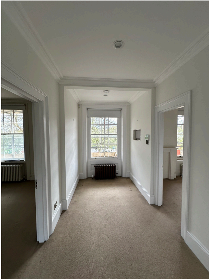
Existing second floor landing