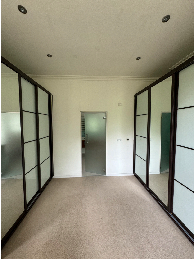
Existing first floor bathroom door