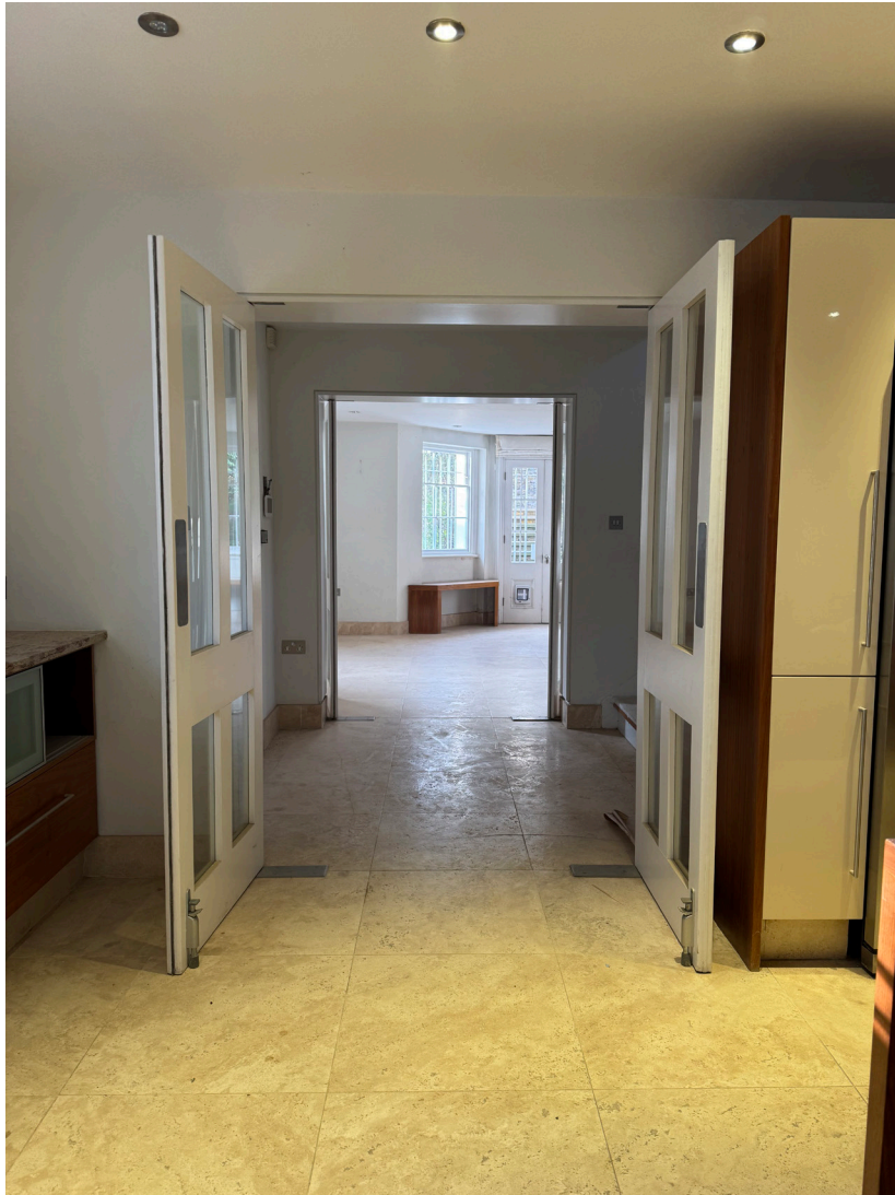
Existing ground floor kitchen door