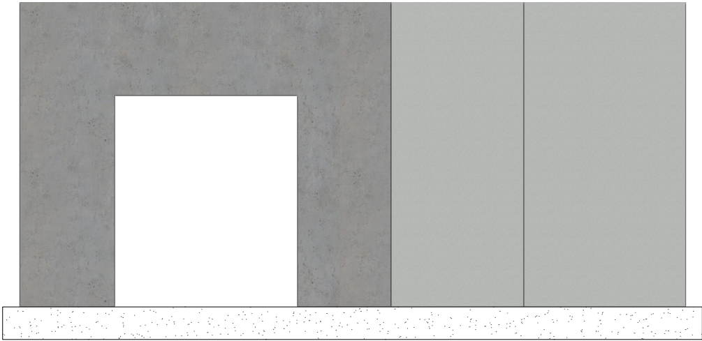
3 Left Side Section Scale: 1:50