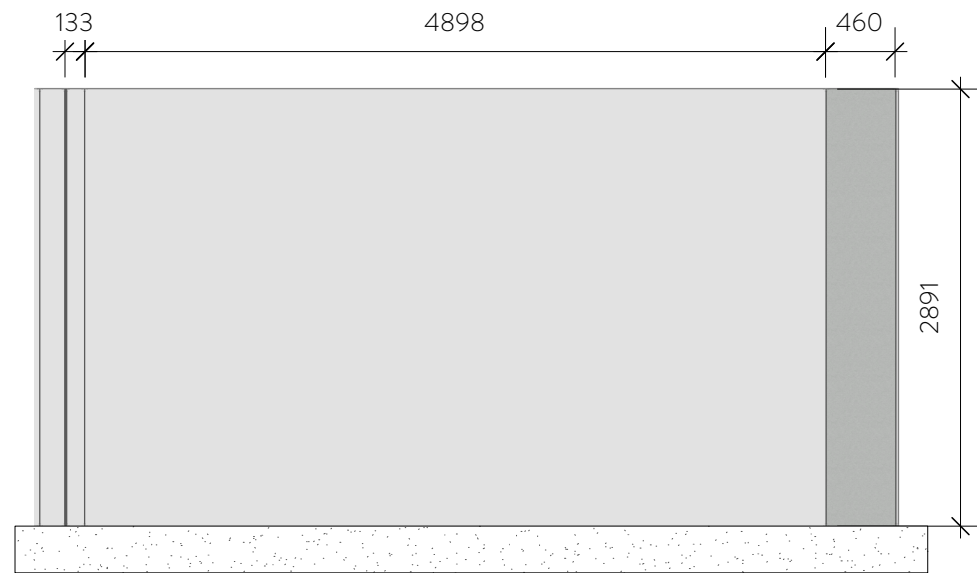
1 Existing Walls Scale: 1:50