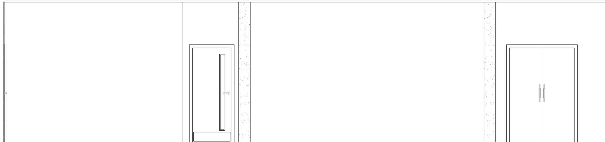
4 SCRR Long Elevation Scale: 1:50