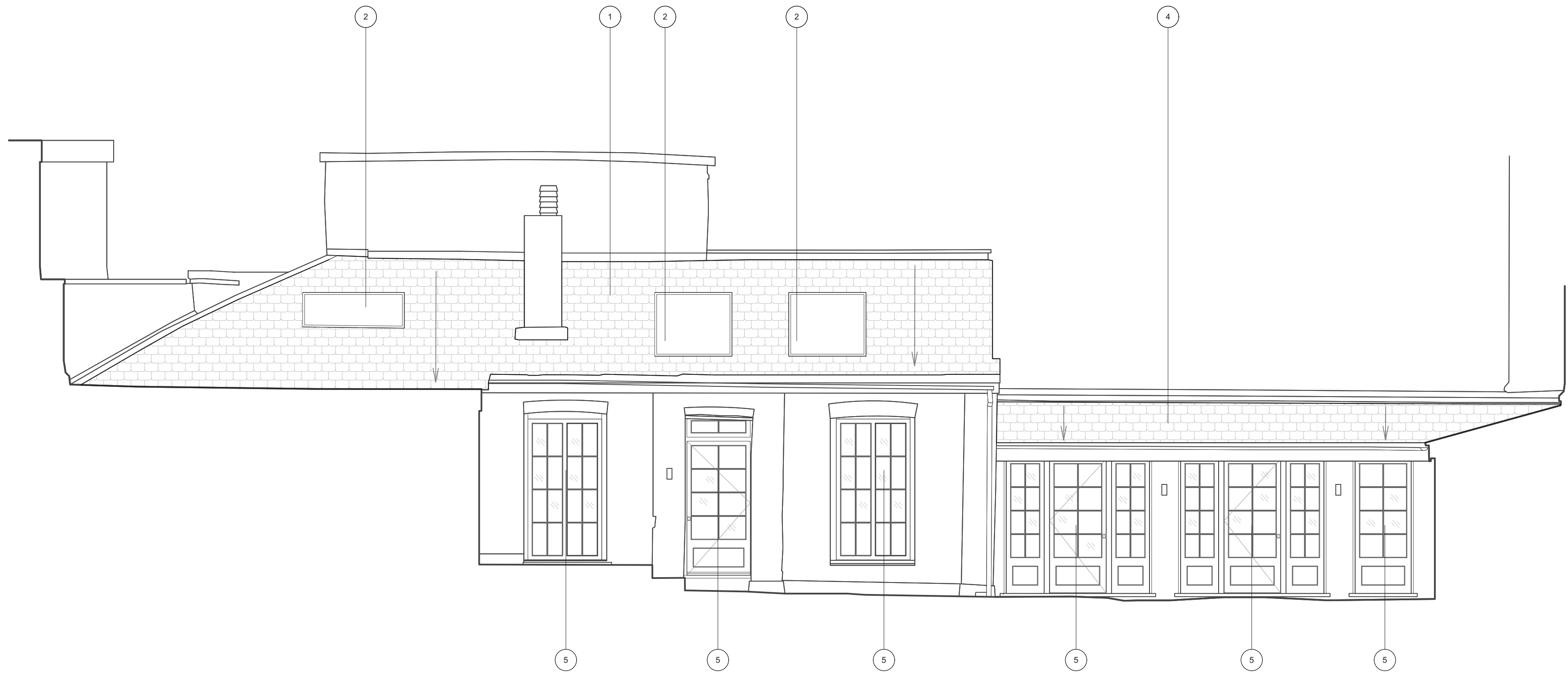
COURTYARD ELEVATION - BB - PROPOSED SCALE: 1:50 @ A1/1:100 @ A3