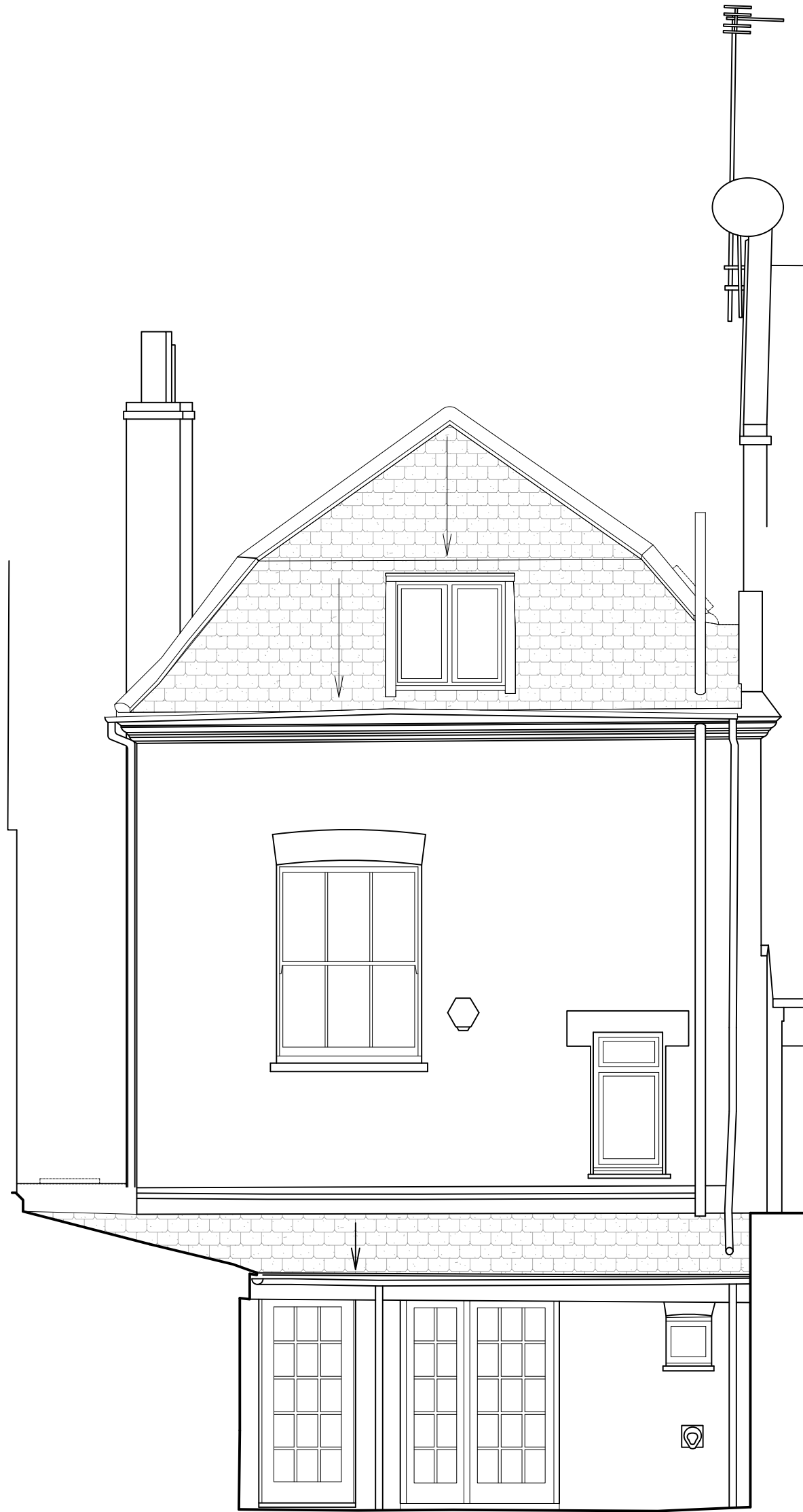
EXISTING COURTYARD ELEVATION - AA SCALE: 1:50 @ A1/1:100 @ A3