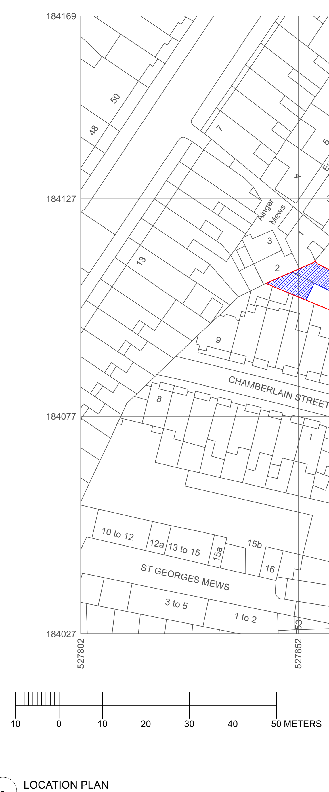
-SCALE: 1:500 @ A1/1:100 @ A3