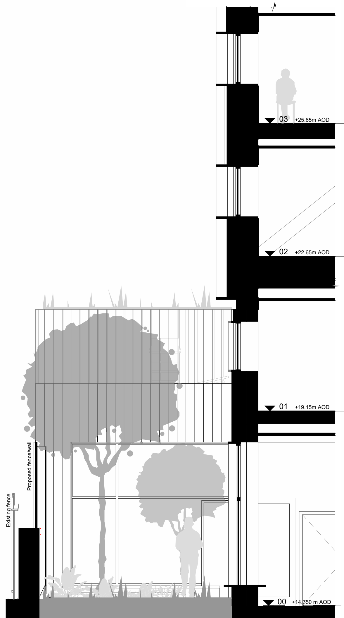
2 Bay Study - West - Section 1 : 50