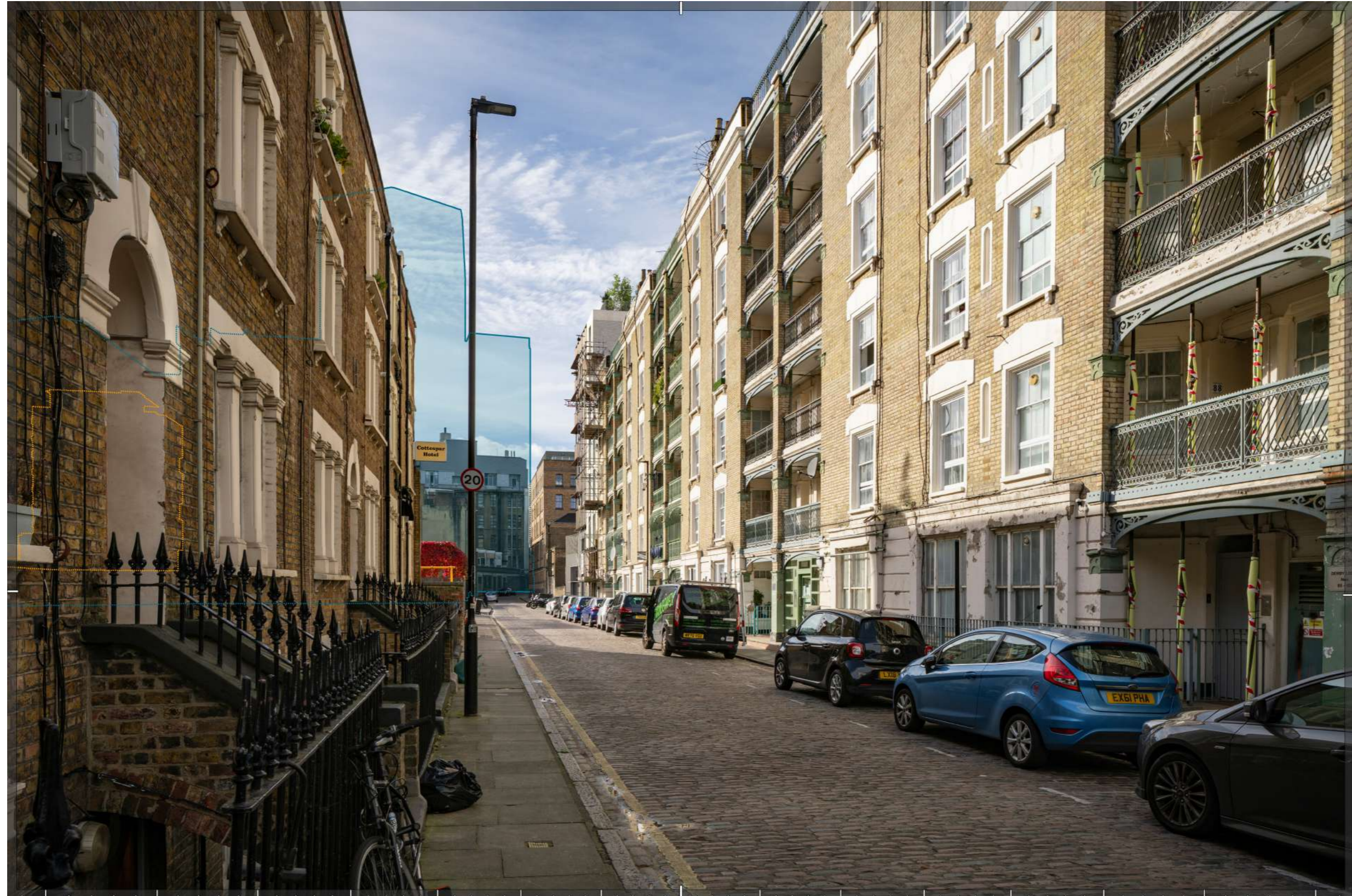
TYPE 4 VISUALISATION