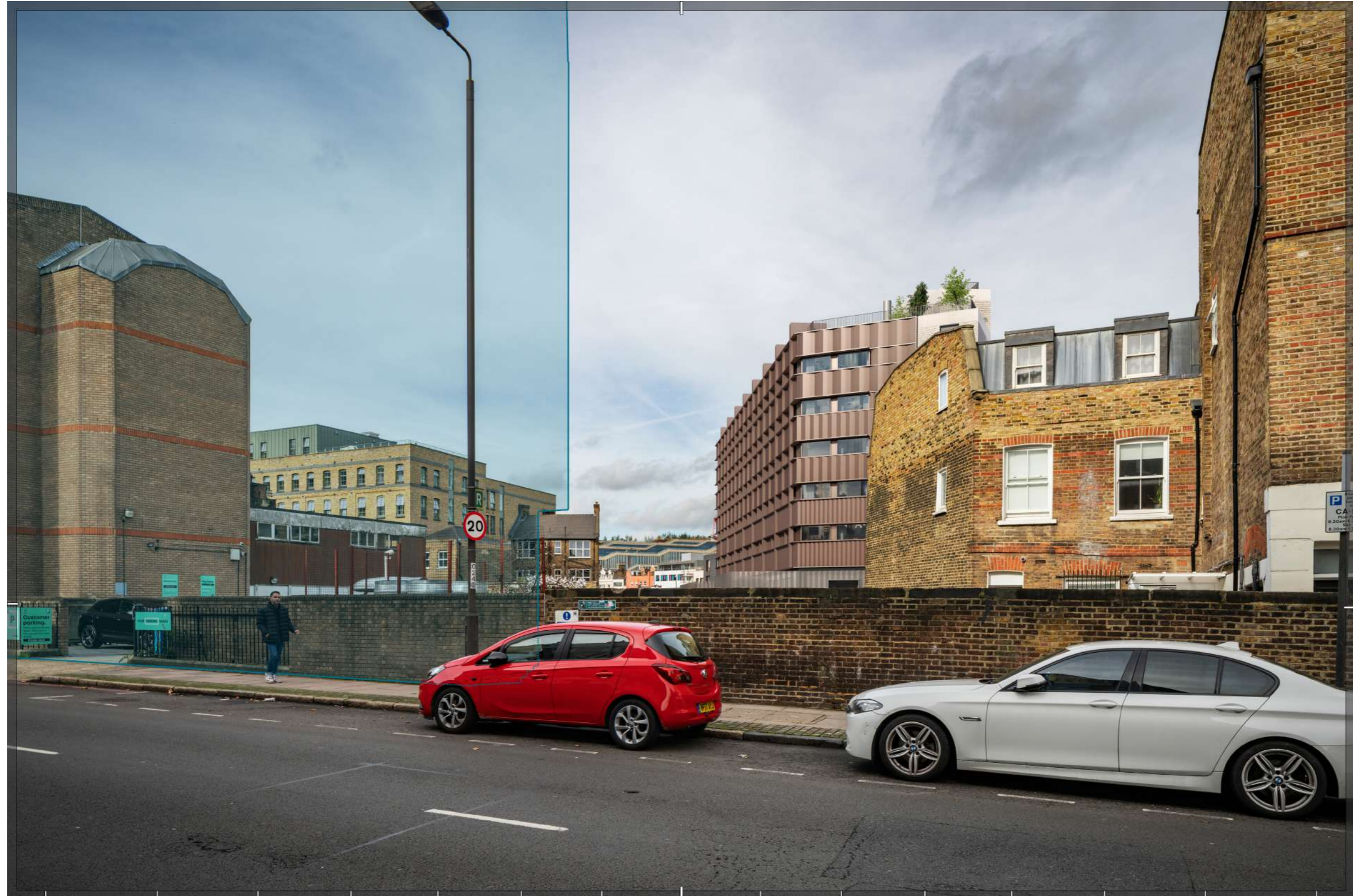
TYPE 4 VISUALISATION