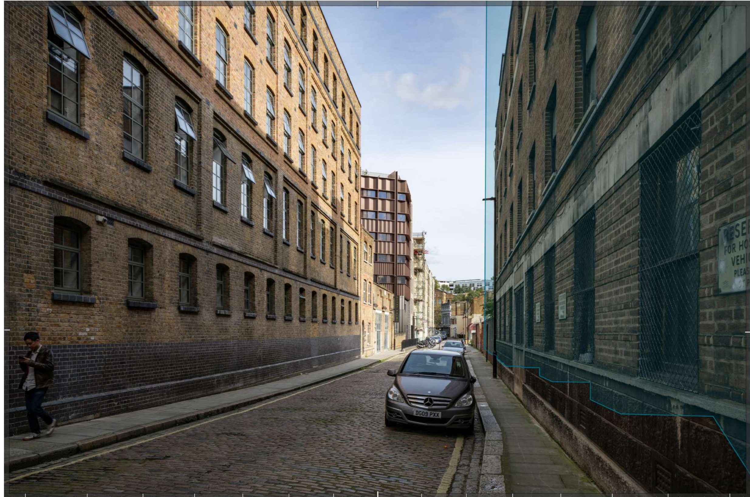
TYPE 4 VISUALISATION