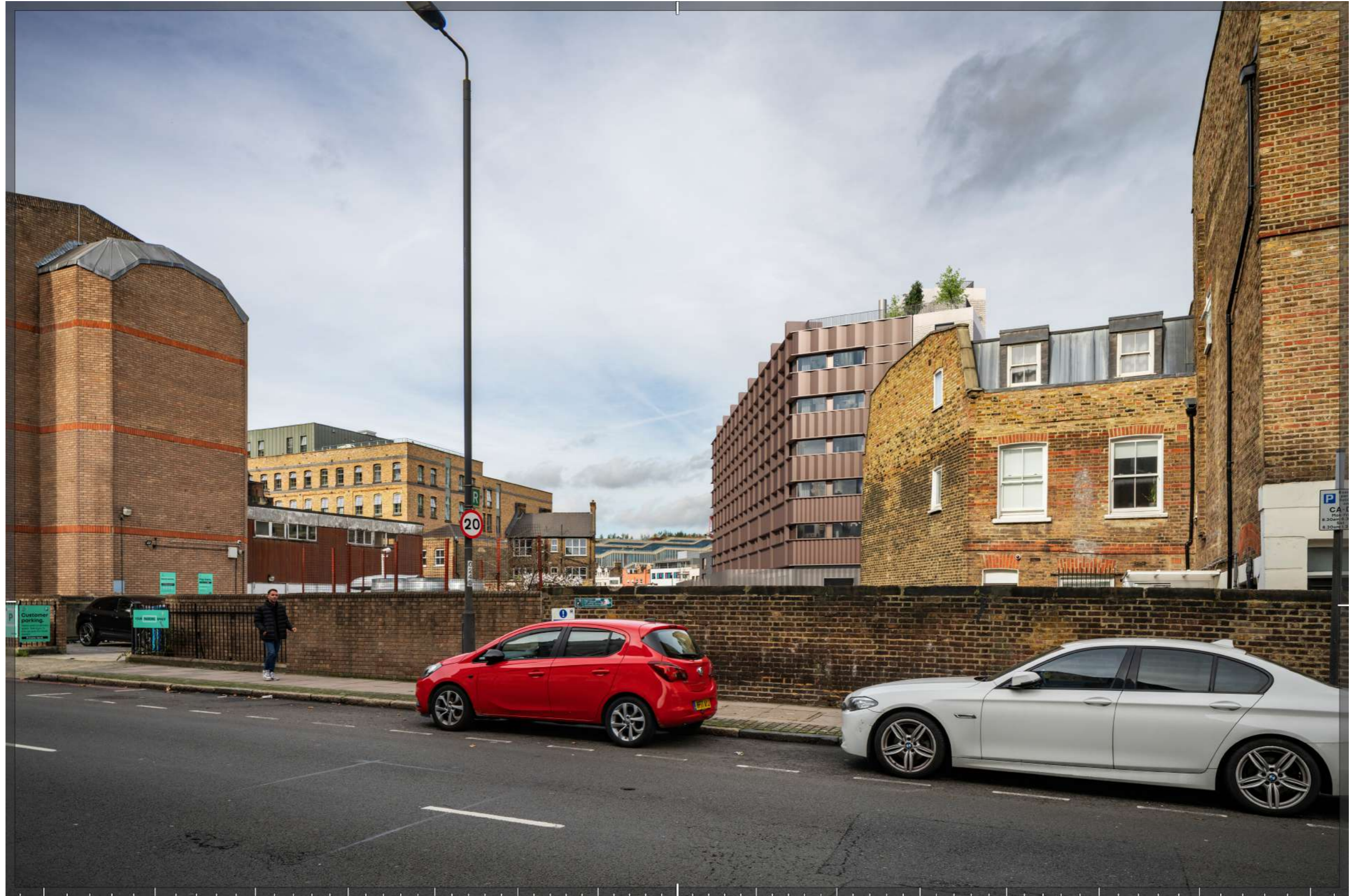
TYPE 4 VISUALISATION