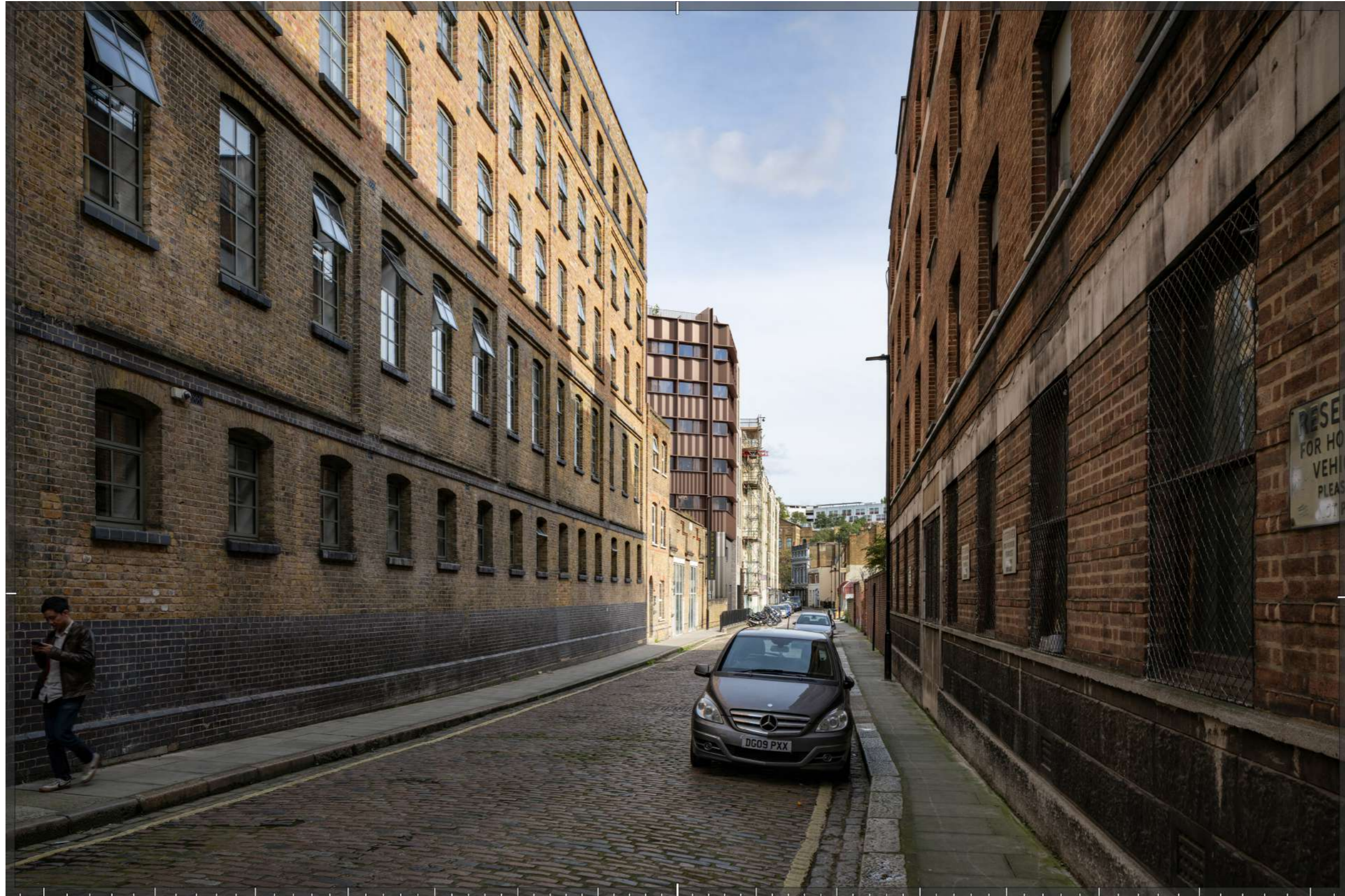
TYPE 4 VISUALISATION