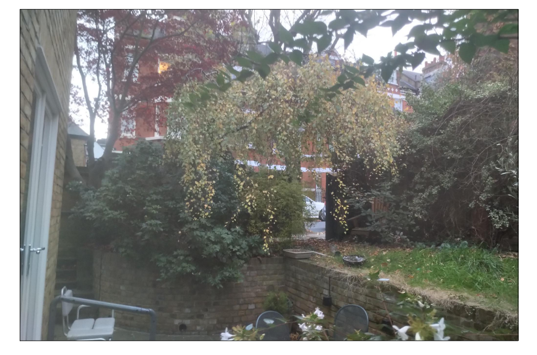
No. 2-and-a-half Rudall Crescent, with back to No. 11 Willoughby Road, view of double gate fronting Rudall Crescent, Maple tree and Willow tree