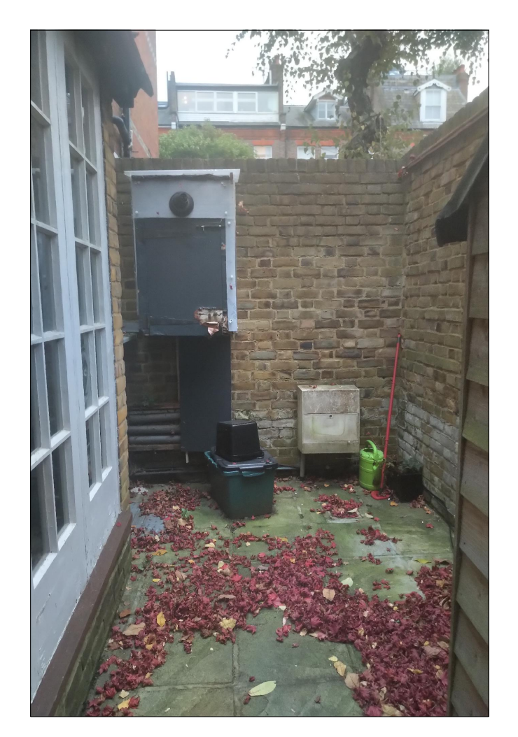
No. 2-and-a-half Rudall Crescent, view from within boundary wall, looking towards boundary wall with No. 9 Willoughby Road