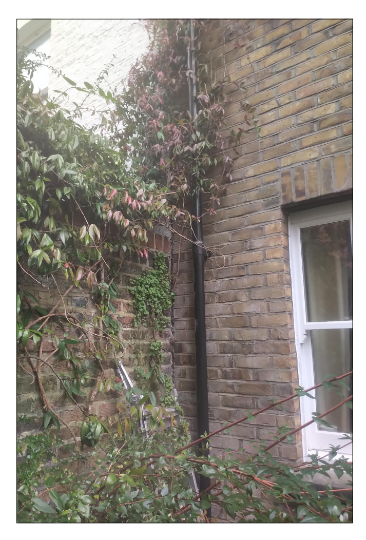
No. 2-and-a-half Rudall Crescent, boundary/ party wall with No. 11 Willoughby Road