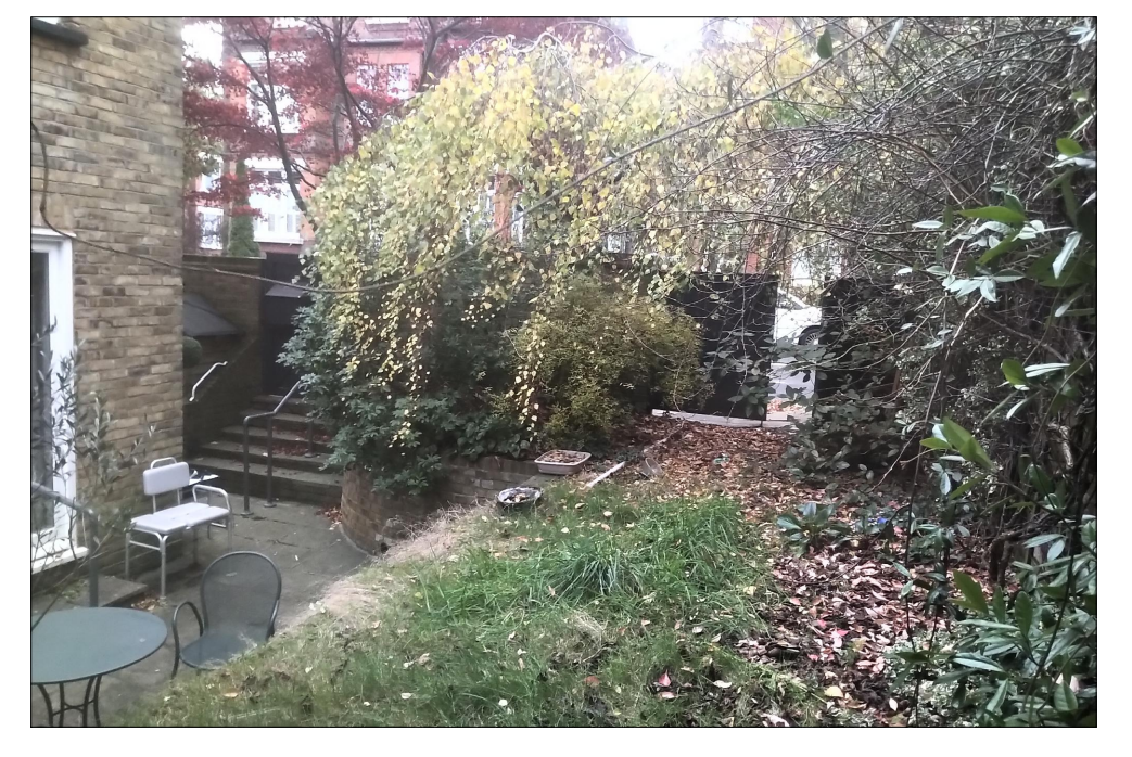
No. 2-and-a-half Rudall Crescent, with back to No. 11 Willoughby Road, view of single entrance gate and double gate fronting Rudall Crescent, Maple tree and Willow tree