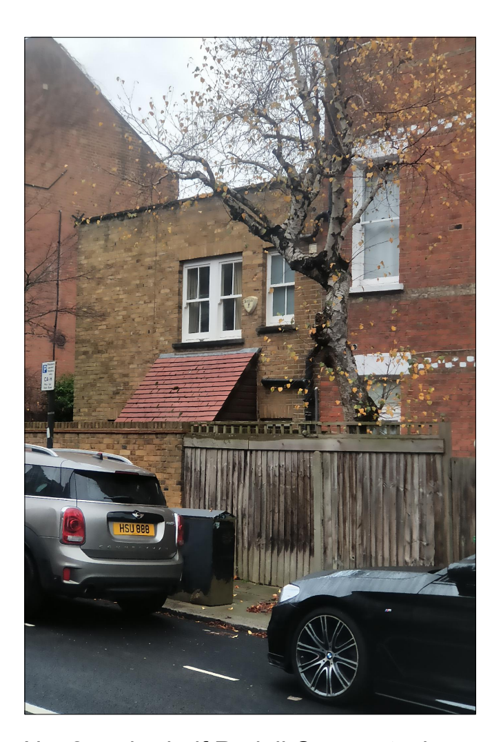
No. 2-and-a-half Rudall Crescent, view of entrance porch roof