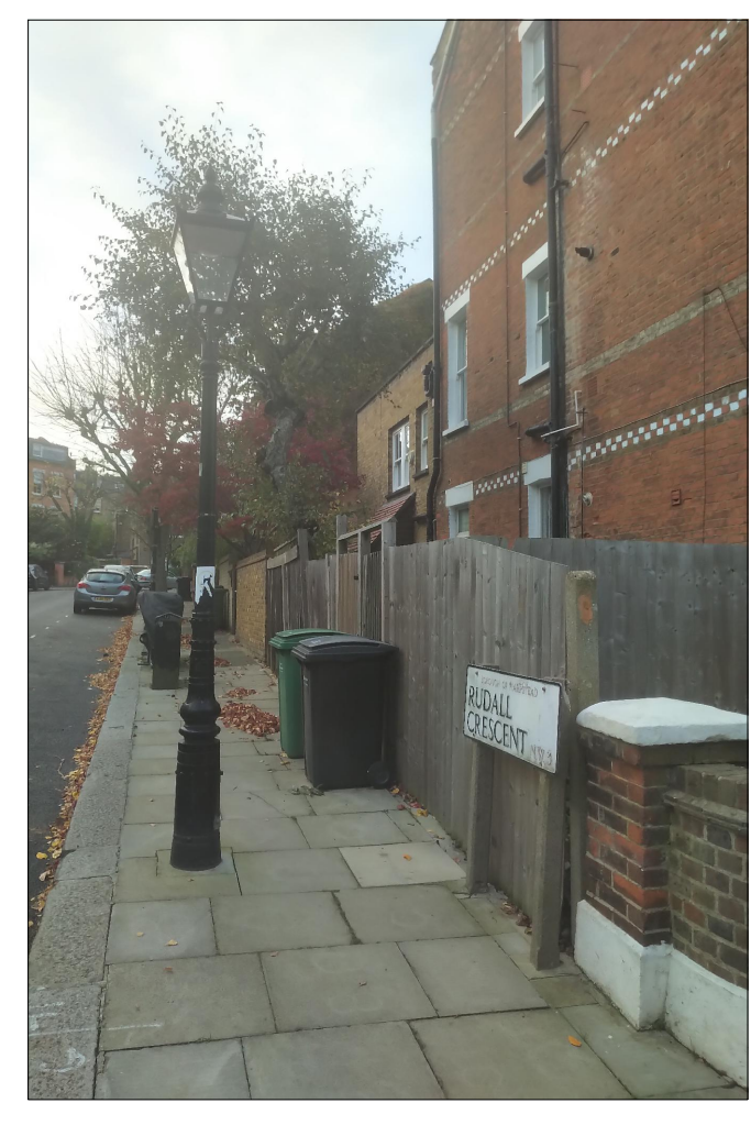
No. 2-and-a-half Rudall Crescent, view from corner of No. 9 Willoughby Road