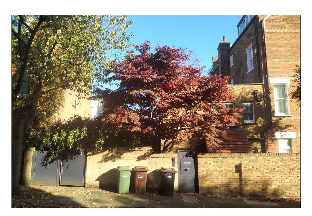
No. 2-and-a-half Rudall Crescent, street view showing boundary wall, and L- R: double gate, willow tree, maple tree, single gate, porch roof, and No. 9 Willoughby Road