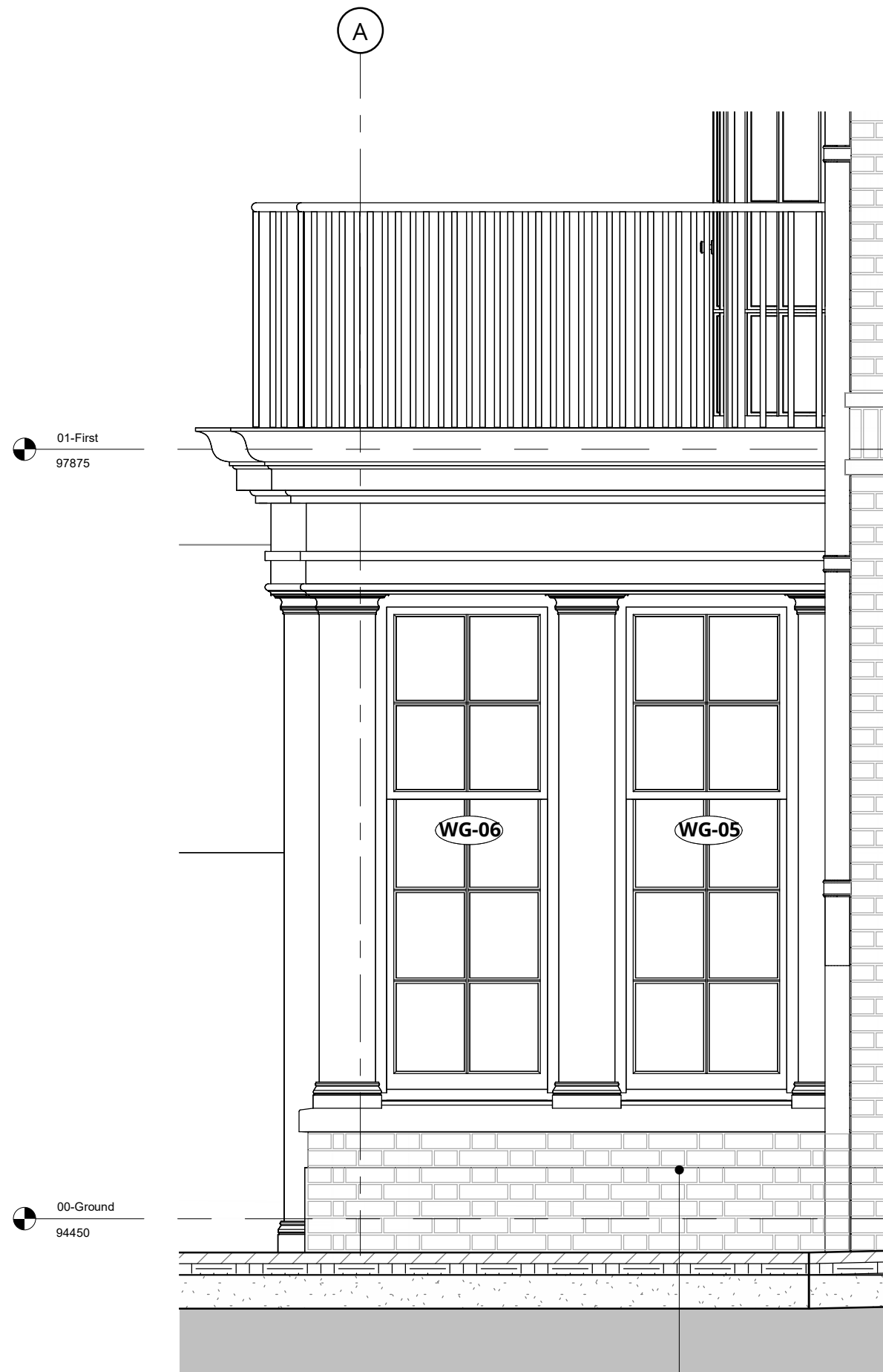
Orangery South East Elevation 1 : 25

This drawing is protected under Copyright and at no time should any portion of this drawing be reproduced or copied without the permission of the Architect (Design Copyright Act 1968). This drawing must not be used for purposes other than that for which it was provided. It is supplied without liability for any errors or omissions. Drawings only to be scaled for planning application purposes, all dimensions to be checked on site. All drawings subject to Statutory Authority Approval.