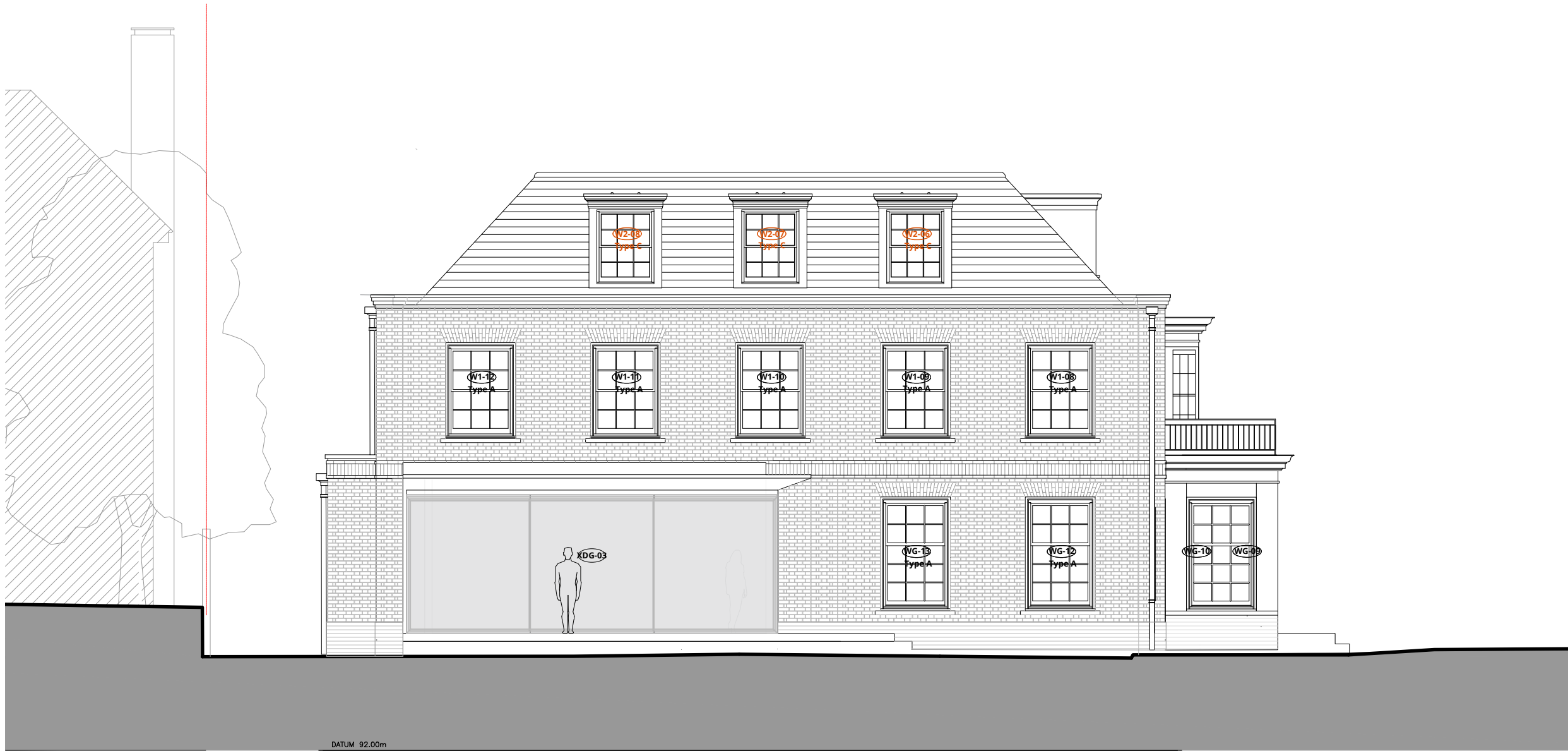
PROPOSED REAR (NORTH WEST) ELEVATION

This drawing is protected under Copyright and at no time should any portion be reproduced or copied without the permission of the Architect (Design Copyright Act 1968). It must not be used for purposes other than that for which it is provided. It is supplied without liability for any errors or omissions. All dimensions to be checked on site.