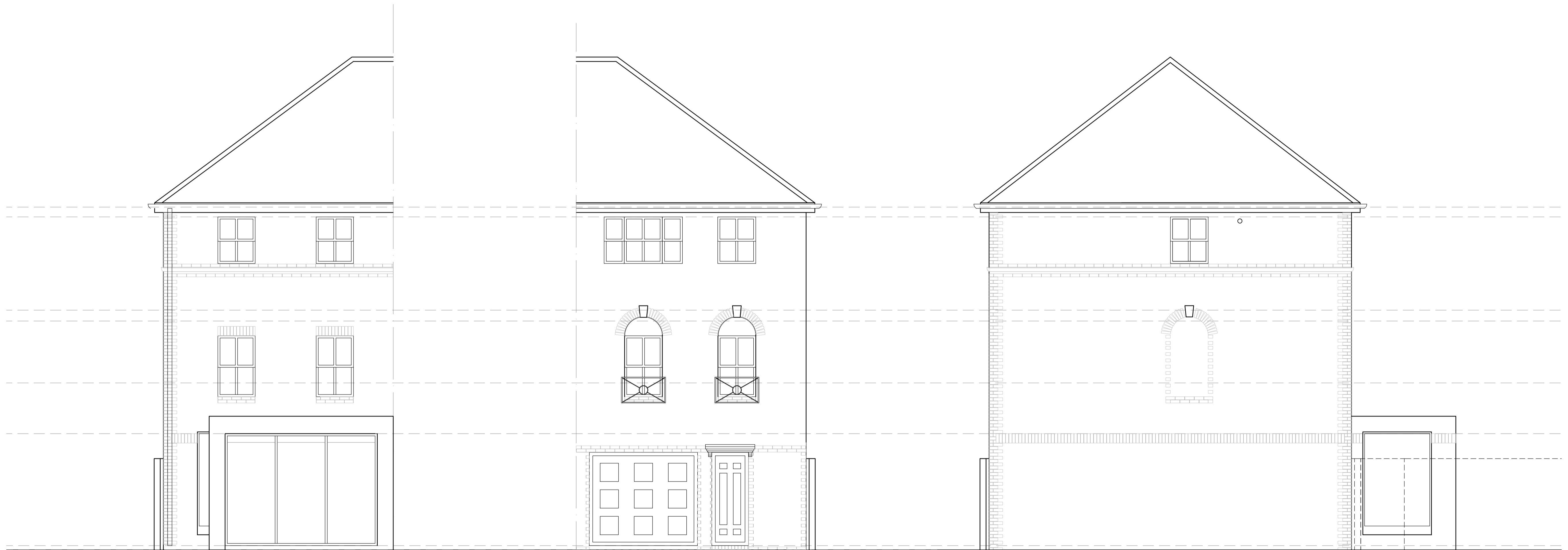
1 1:50 REAR ELEVATION E 200 EXISTING