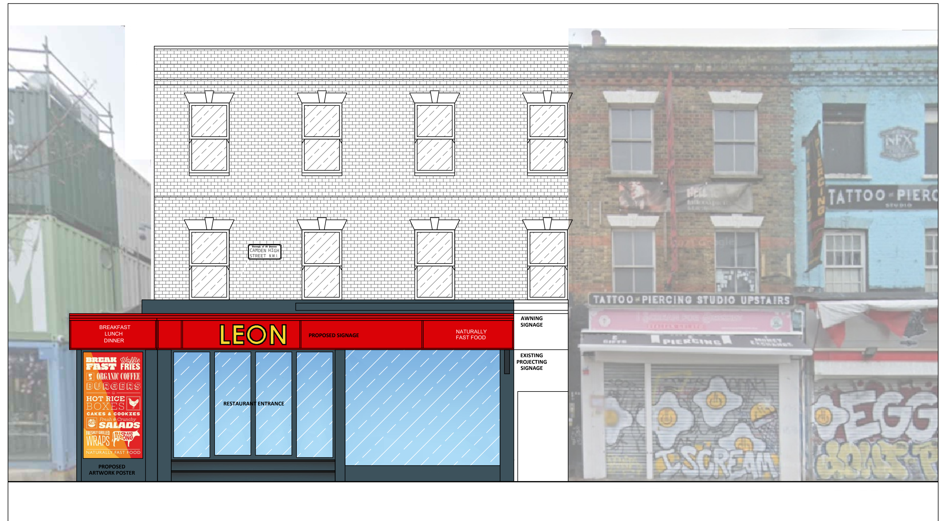
PROPOSED STREET ELEVATION SCALE: 1:50

Portland eco lux Mini through light warm LED - Finish: Red RAL 3020