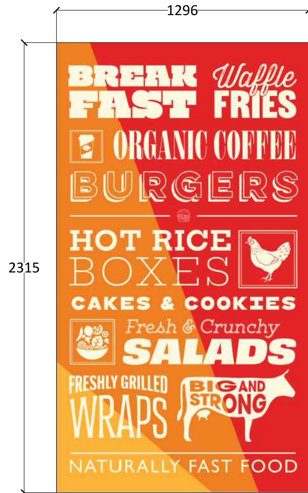
Vinyl Graphic - Face applied printed vinyl graphic c/w matt over laminate