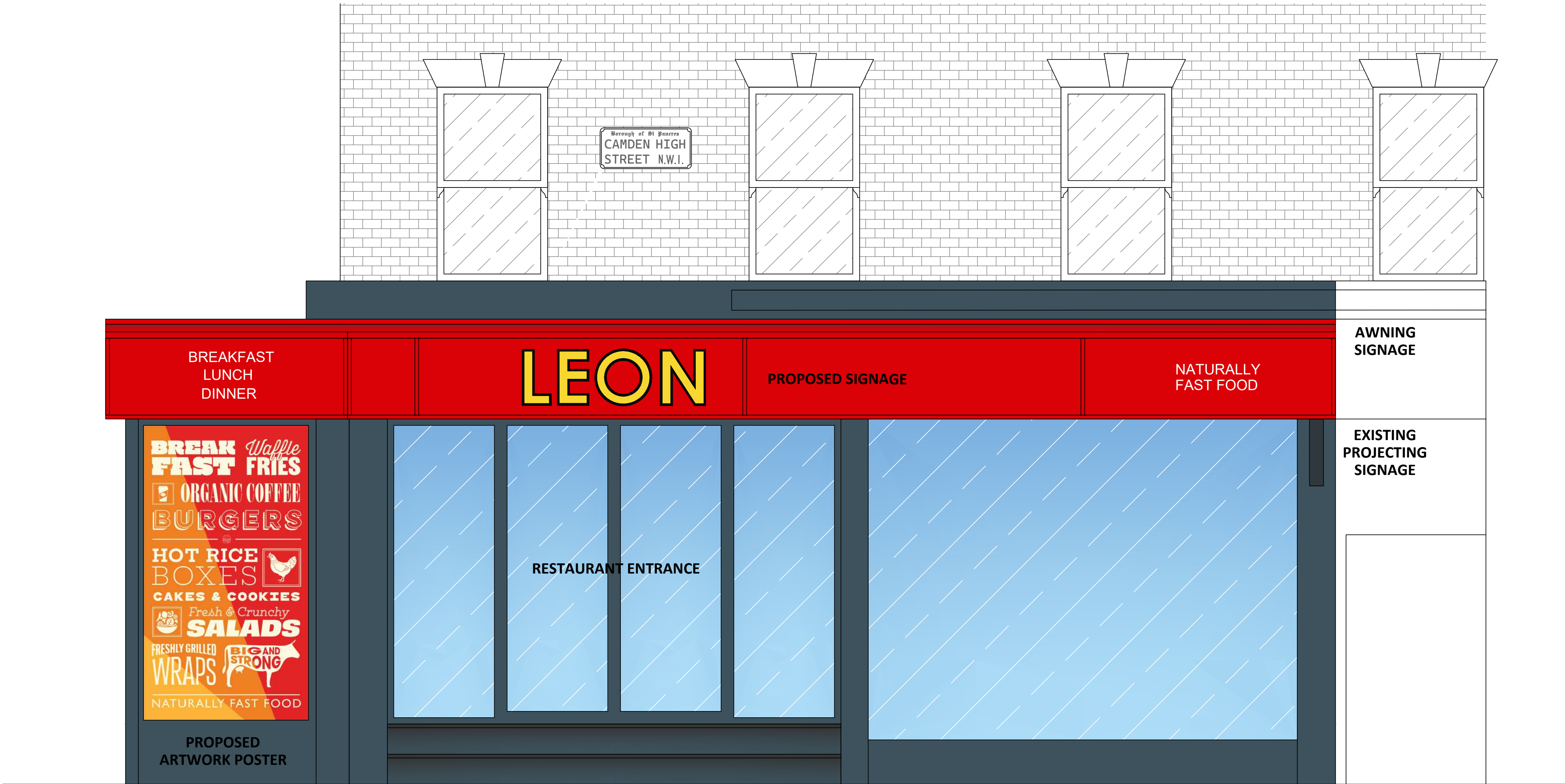
PROPOSED ELEVATIONS SCALE: 1:20