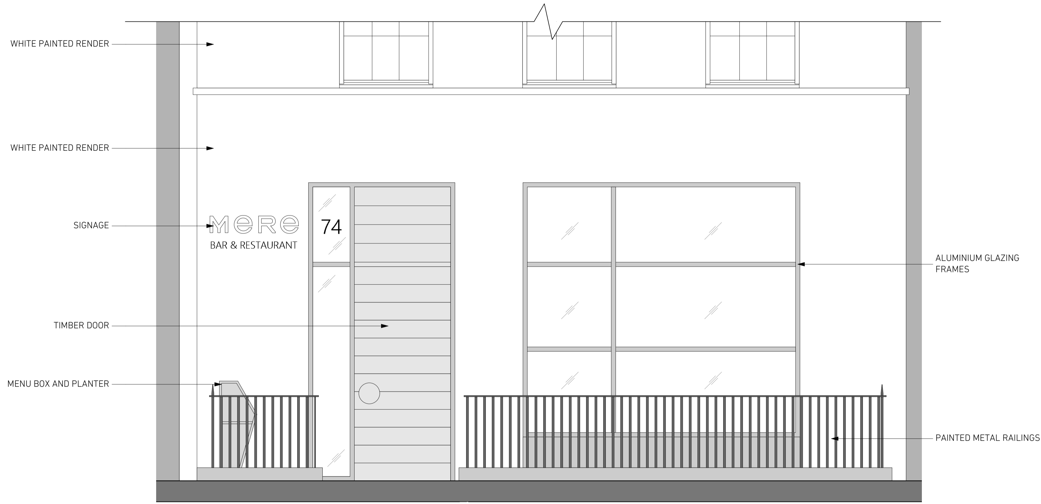
2 FRONT ELEVATION