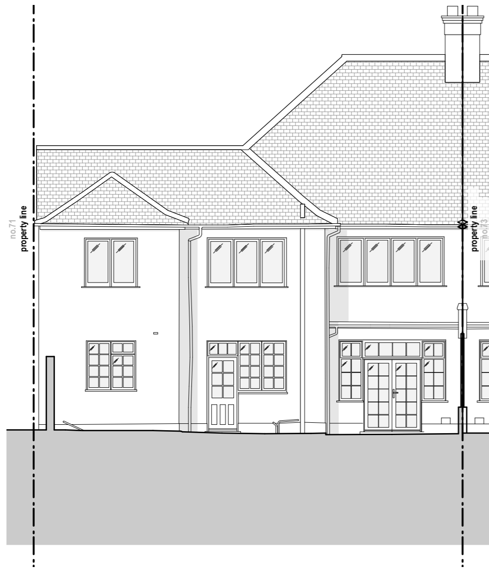
Existing Elevation - Rear 1:100