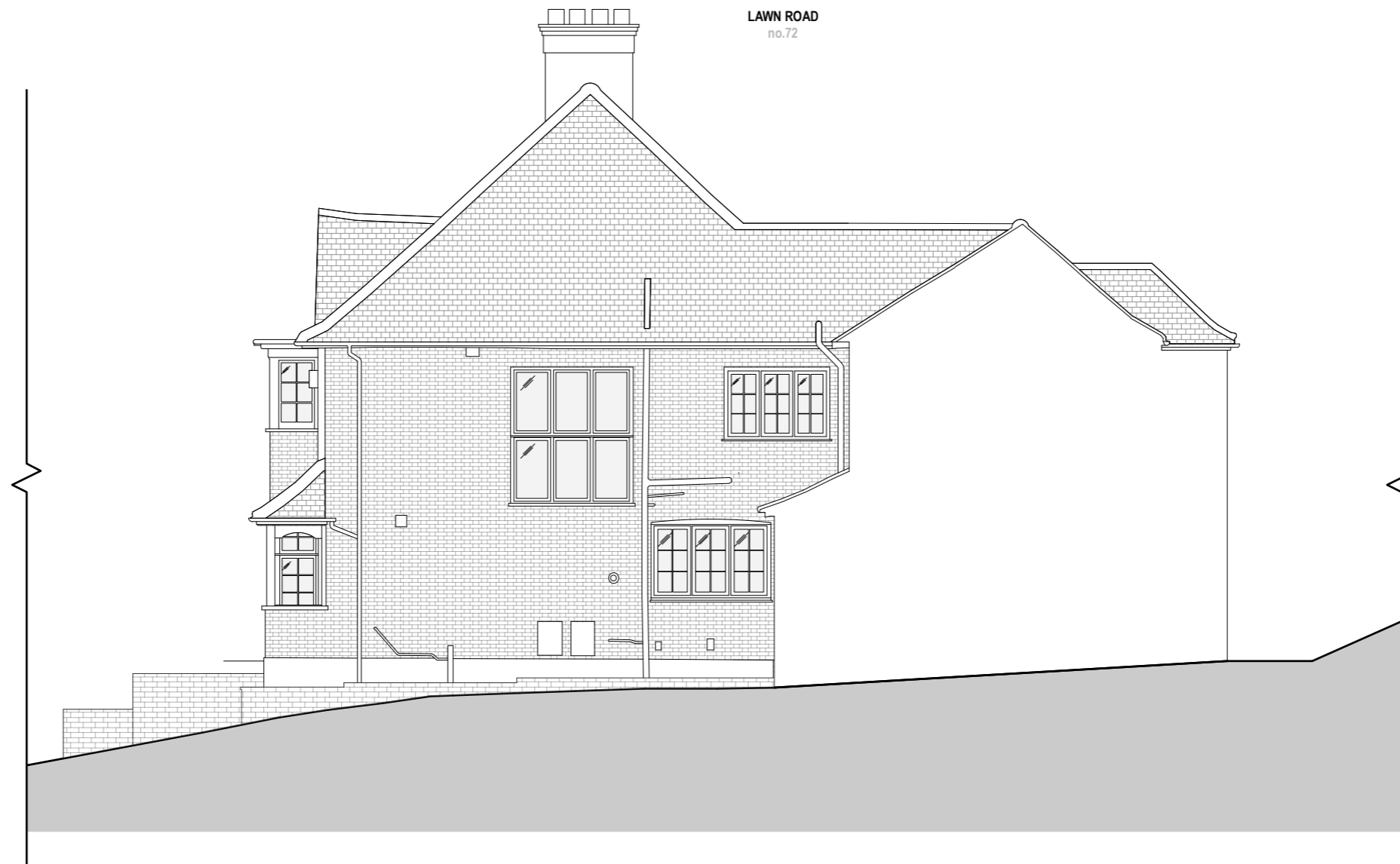
Existing Elevation - Side (North)