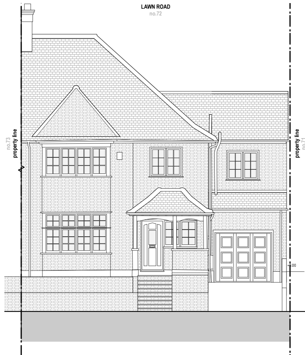
Existing Elevation - Front / Street